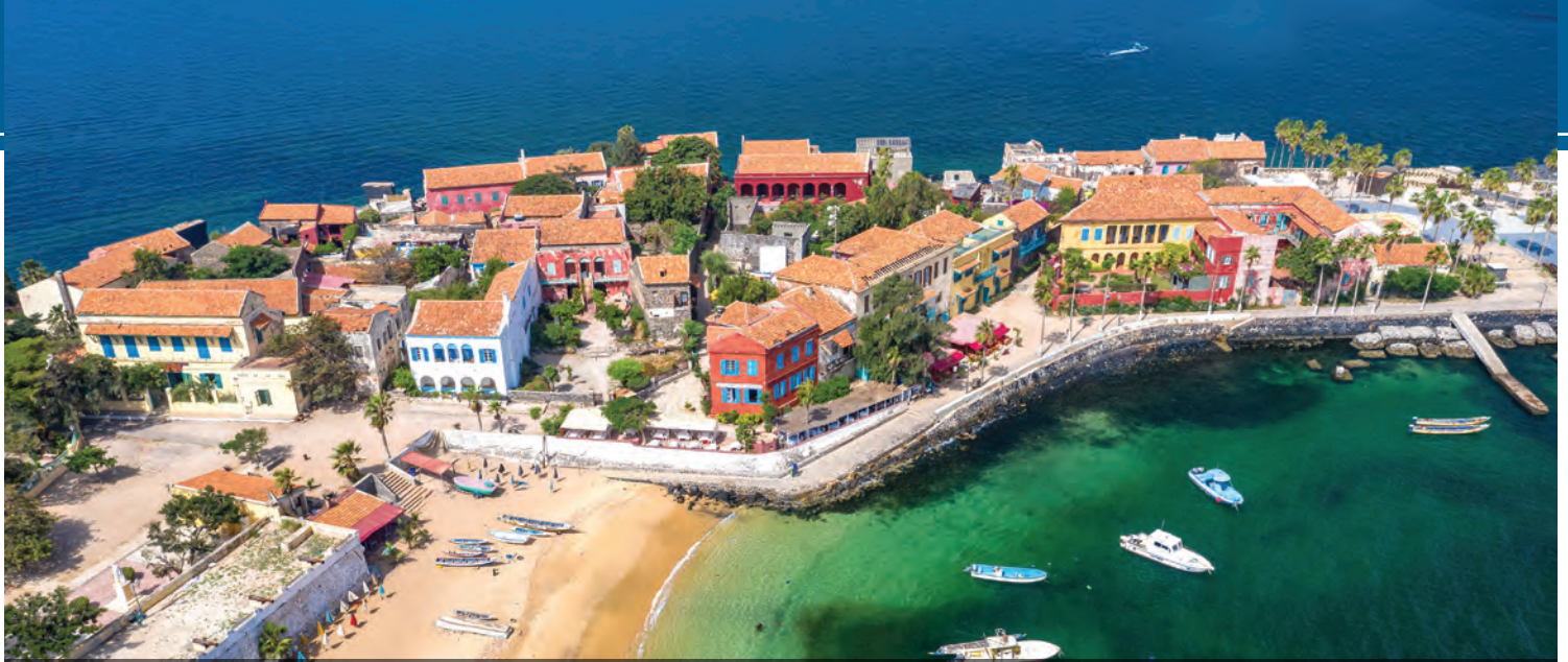
Senegal's Gorée Island, a UNESCO World Heritage Site

briefings from the expert expedition staff, simply relax and enjoy cruising the open sea, or perhaps treat yourself to some of Diana's many amenities. (B,L,D)