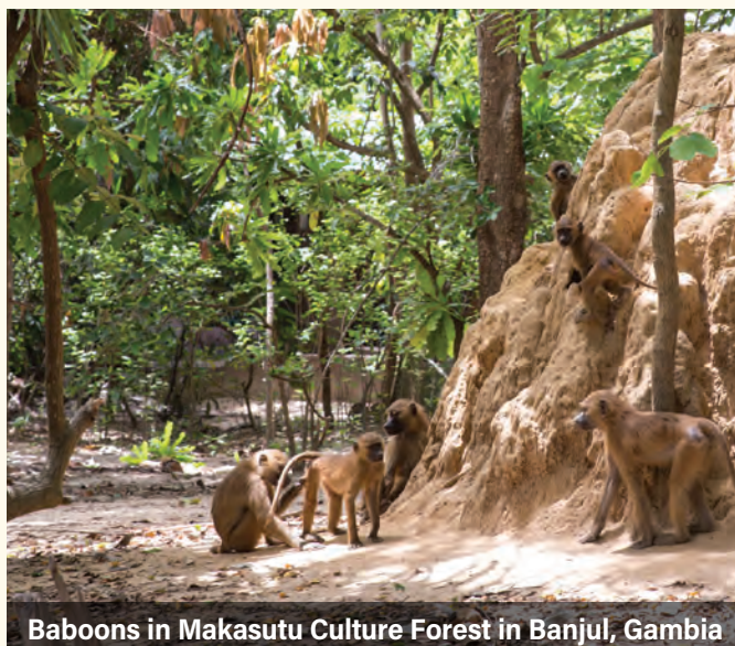
Baboons in Makasutu Culture Forest in Banjul, Gambia