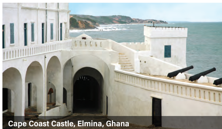
Cape Coast Castle, Elmina, Ghana

westernmost point, Dakar has grown into a vibrant metropolis. This morning, we visit the UNESCO World Heritage Site of Gorée Island, a center of the West African slave trade. Our tour includes the Historical Museum, the Slave House, St. Charles de Borromée Church, and the Castle Fortress, with stunning views across the channel back to Dakar. Embark Diana for an overnight in port. (B,L,D)