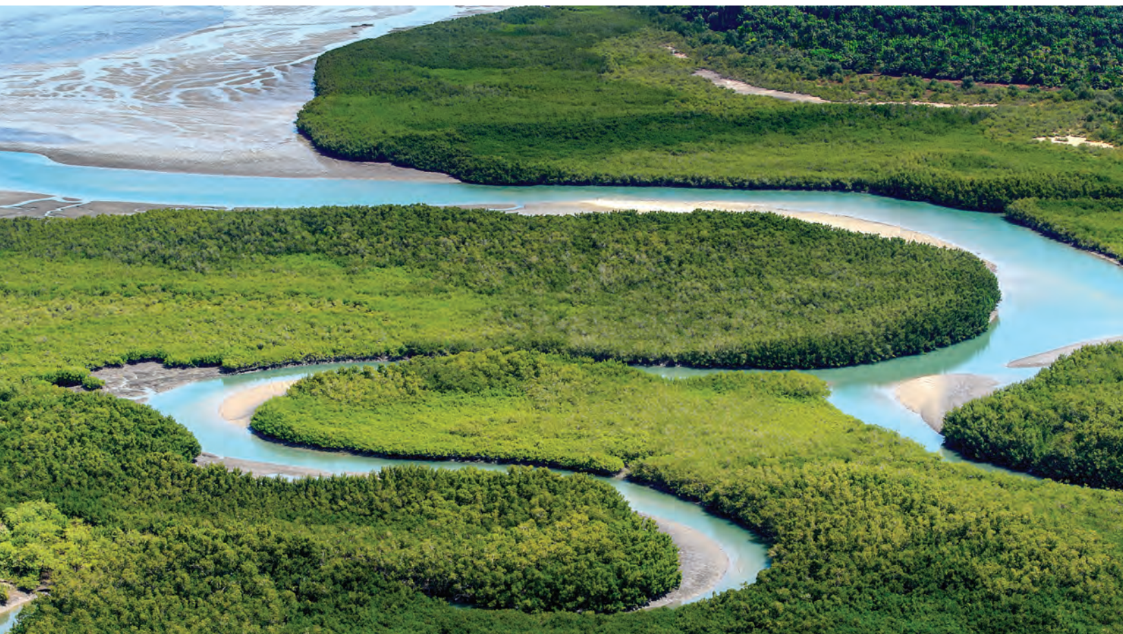
Bijagos Archipelago, Guinea-Bissau, a UNESCO Biosphere Reserve