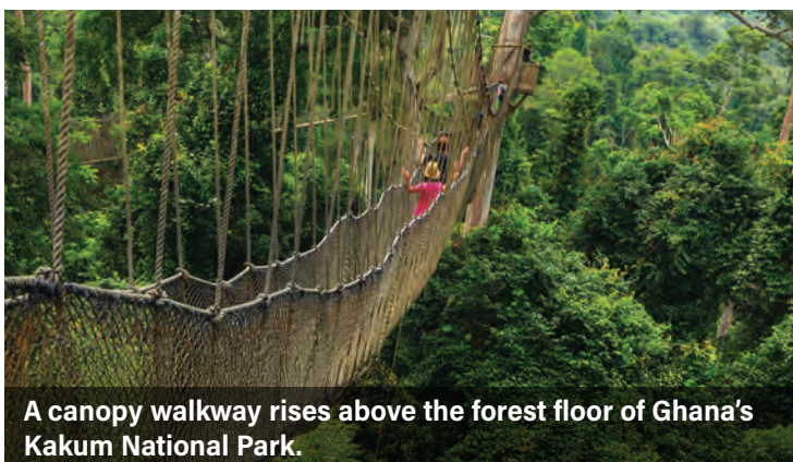
A canopy walkway rises above the forest floor of Ghana's Kakum National Park.

Enjoy a day at sea, attend lectures by Ambassador Gribbin and briefings from the expert expedition staff. Also use the time simply to relax and enjoy cruising the open sea, perhaps treating yourself to some of Diana's many amenities. (B,L,D)