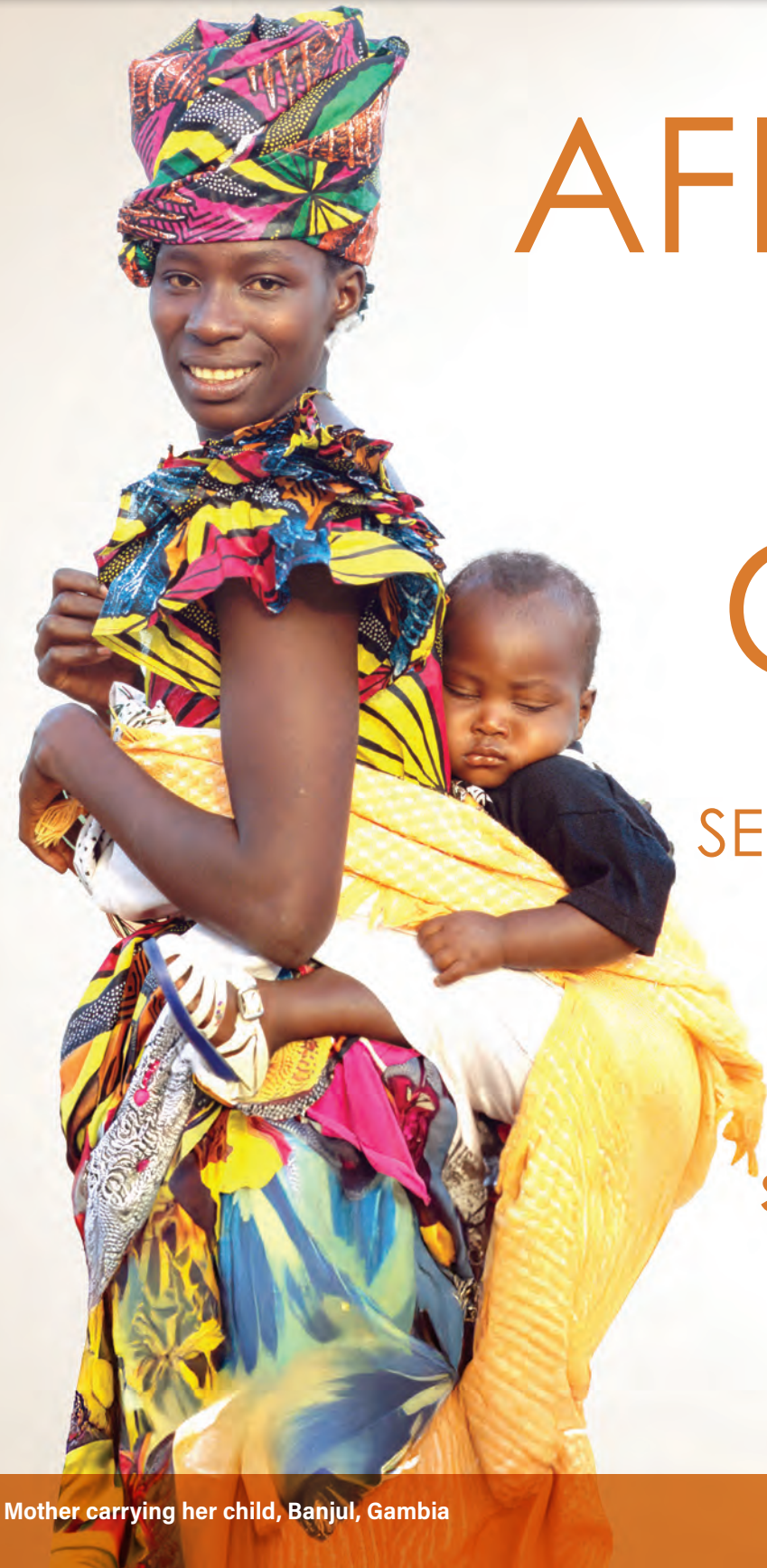
Mother carrying her child, Banjul, Gambia