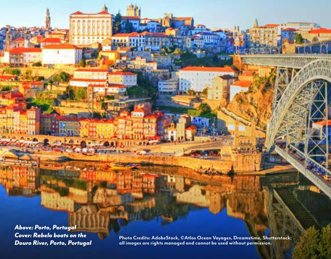
Above: Porto, Portugal