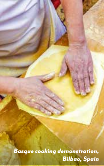
Basque cooking demonstration, Bilbao, Spain