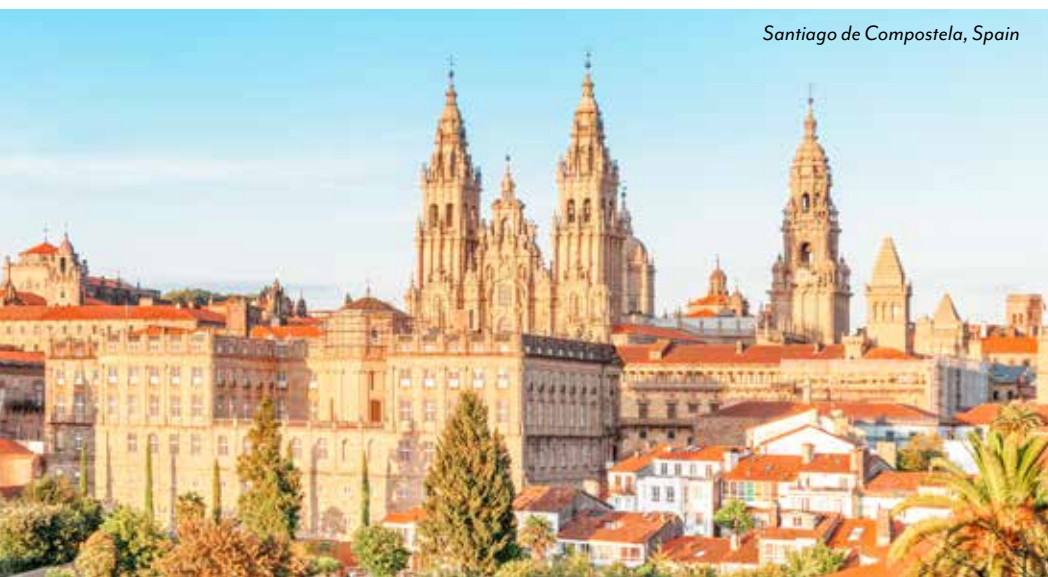
Santiago de Compostela, Spain

than 1,000 years. Rising from a tidal plain that appears to be suspended above the sea, this UNESCO World Heritage site is a vision of soaring spires isolated beyond a stretch of saltwater marsh. Cobblestone streets weave through the village, culminating at the Abbaye du Mont-Saint-Michel, a three-story Gothic masterpiece. Admire the serene cloisters, barrel-roofed réfectoire and Salle des Hôtes of the 13th-century La Merveille and the magnificent Église Abbatiale.