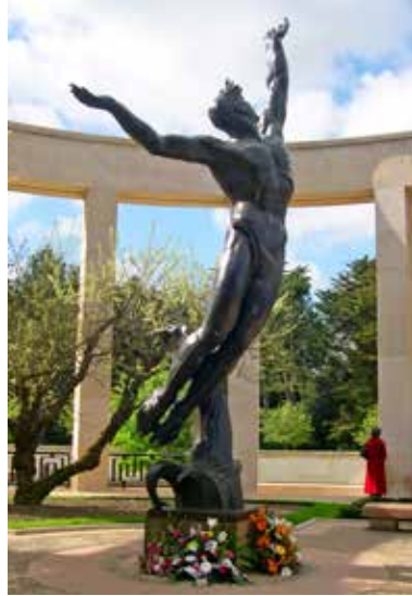
Normandy American Cemetery, France