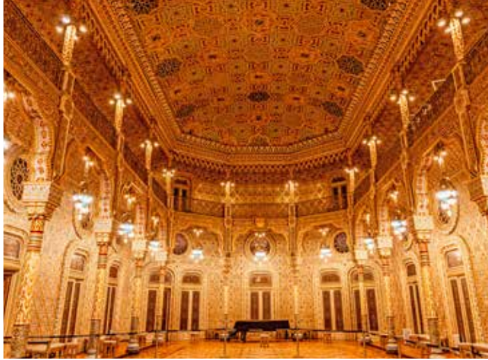
Stock Exchange Palace, Porto, Portugal