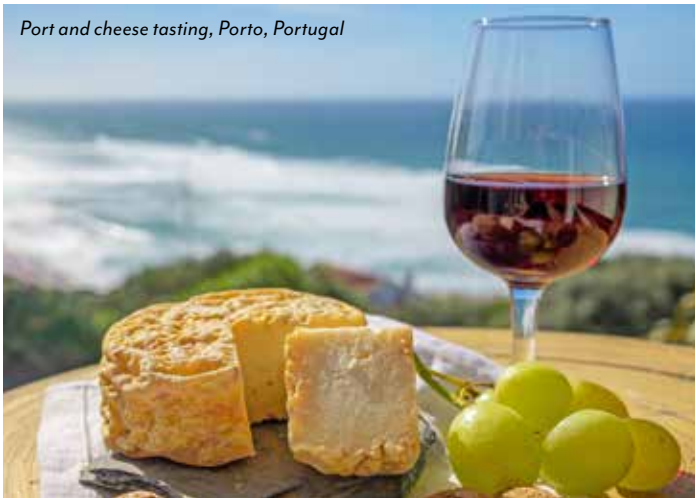
Port and cheese tasting, Porto, Portugal

Santiago de Compostela has been a world-renowned pilgrimage site since the 9th century when a light was seen shining over a forgotten Roman tomb believed to be that of St. James the Great. Stroll along stone streets to the Praza do Obradoiro square, where you may admire the splendid Palacio de Rajoy. Visit the hallowed sanctuary of Spain’s patron saint — a legendary cathedral that holds the remains of St. James. Marvel at the ornate blend of styles on its interior, ranging from Romanesque to baroque.