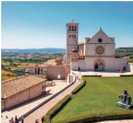
Basilica of San Francesco, Assisi

Cooperating Councils: ALASKA ♦ ALABAMA ♦ ALASKA ♦ ARIZONA ♦ ATLANTA ♦ AUSTIN ♦ BALTIMORE ♦ BOSTON ♦ BUFFALO ♦ CHARLESTON ♦ CHARLOTTE ♦ CHICAGO ♦ GREATER CINCINNATI ♦ CLEVELAND ♦ COLORADO SPRINGS ♦ COLUMBUS ♦ CONNECTICUT ♦ DALLAS-FORT WORTH ♦ DAYTON ♦ DENVER ♦ GREATER HAMPTON ROADS ♦ HARRISBURG ♦ HILTON HEAD ♦ HOUSTON ♦ INLAND SOUTHERN CALIFORNIA ♦ JACKSONVILLE ♦ KANSAS CITY ♦ KENTUCKY/SOUTH INDIANA ♦ LAS VEGAS ♦ LOS ANGELES ♦ MAINE ♦ MID-HUDSON VALLEY ♦ MILWAUKEE ♦ MONTANA ♦ MONTEREY BAY ♦ NAPLES ♦ NEW ORLEANS ♦ NEW HAMPSHIRE ♦ NORTHERN CALIFORNIA ♦ ORANGE COUNTY ♦ OREGON ♦ PALM BEACH ♦ PEORIA ♦ PITTSBURGH ♦ GREATER READING ♦ RHODE ISLAND ♦ RICHMOND ♦ SAN ANTONIO ♦ SAN DIEGO ♦ SANTA FE ♦ SAVANNAH ♦ SEATTLE ♦ SONOMA COUNTY ♦ SOUTH TEXAS ♦ ST. LOUIS ♦ STAMFORD ♦ TACOMA ♦ TENNESSEE ♦ TRAVERSE CITY ♦ UTAH ♦ VERMONT ♦ WESTERN COLORADO ♦ WESTERN MICHIGAN ♦ WESTERN NORTH CAROLINA