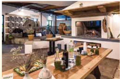
Oleoteca Bartolomei Olive Mill

A Day in Tuscany. Begin in the Etruscan city of Cortona, taking a guided walk past historic