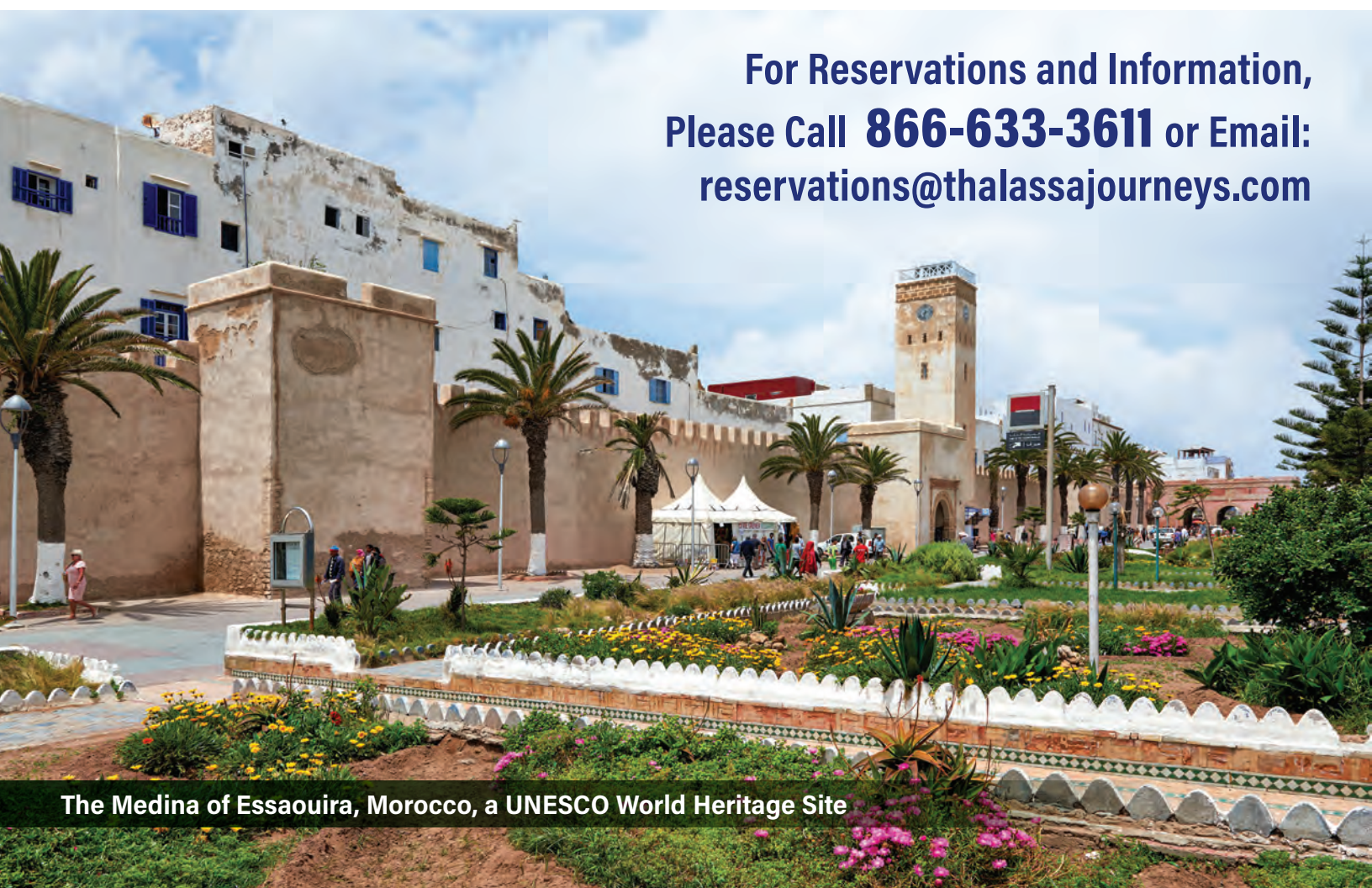
The Medina of Essaouira, Morocco, a UNESCO World Heritage Site

For Reservations and Information, Please Call 866-633-3611 or Email: reservations@thalassajourneys.com