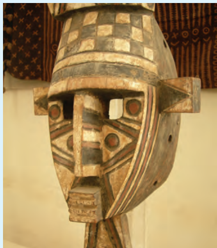
Théodore Monod Museum of African Art, Dakar, Senegal

NOT INCLUDED: International airfare; travel insurance; expenses of a personal nature; any items not mentioned in the itinerary or the above inclusions.