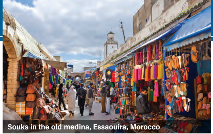
Souks in the old medina, Essaouira, Morocco

the Grand Mosque and spend some time browsing the nearby souks, where vendors hawk everything from dried dates and colorful fabrics to spare car parts. (B,L,D)