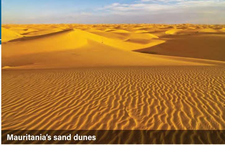
Mauritania's sand dunes