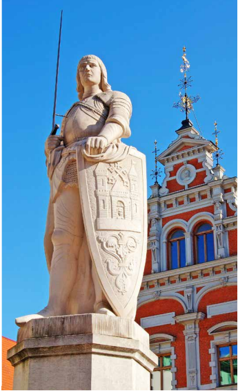
St. Roland Statue, Riga, Latvia

Disembark for your chosen excursion in Visby, a charming town on Sweden’s largest island, Gotland. This well-preserved medieval town — dating back to the 12th century — is a UNESCO World Heritage site and is filled with natural beauty and ancient history. Choose to take a walking tour of the Old Town and the fascinating Gotlands Museum, or embark on a guided tour of the medieval sights — admiring the city walls, towers, alleyways and churches.