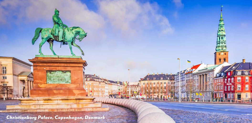
Christianborg Palace, Copenhagen, Denmark

Solidarity Movement — the first independent trade union in the Soviet Bloc — began in 1980. Visit the Monument to the Fallen Shipyard Workers of 1970 and the European Solidarity Centre.