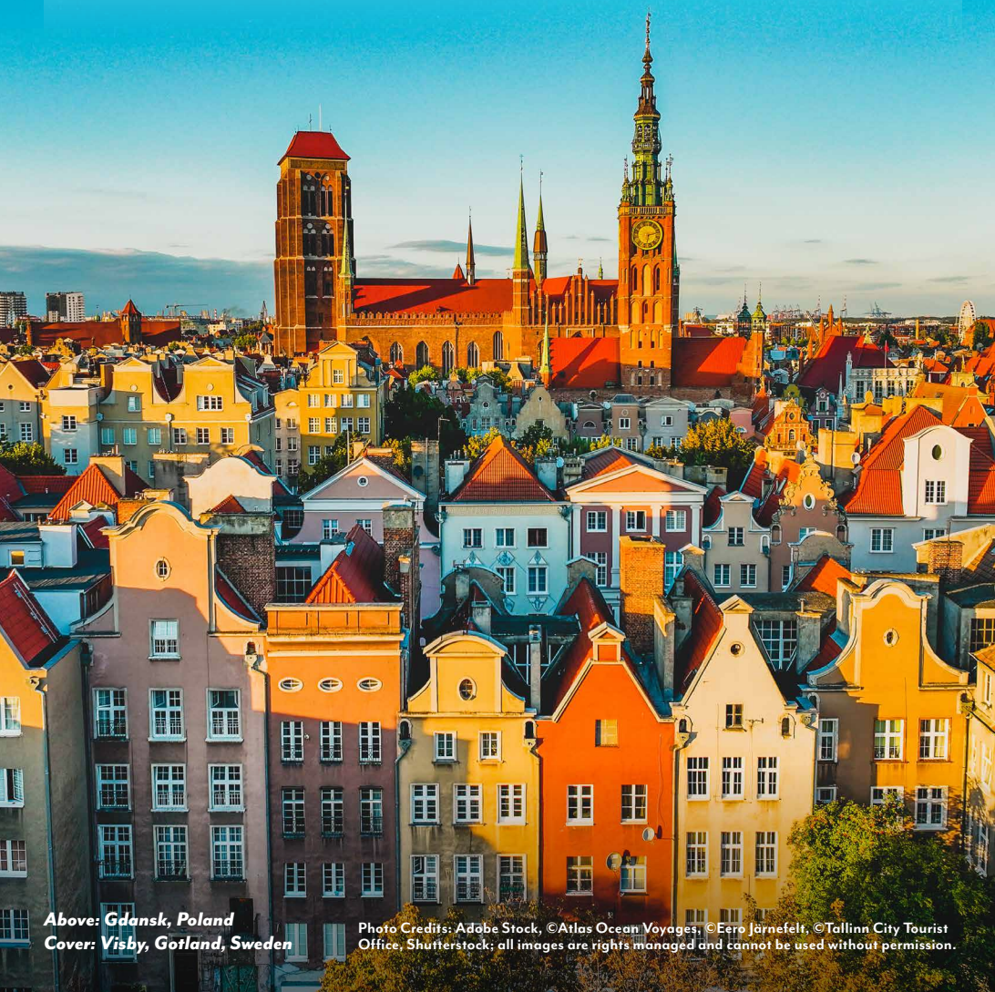
Above: Gdansk, Poland Cover: Visby, Gotland, Sweden

Photo Credits: Adobe Stock, ©Atlas Ocean Voyages, ©Eero Järnefelt, ©Tallinn City Tourist Office, Shutterstock; all images are rights managed and cannot be used without permission.