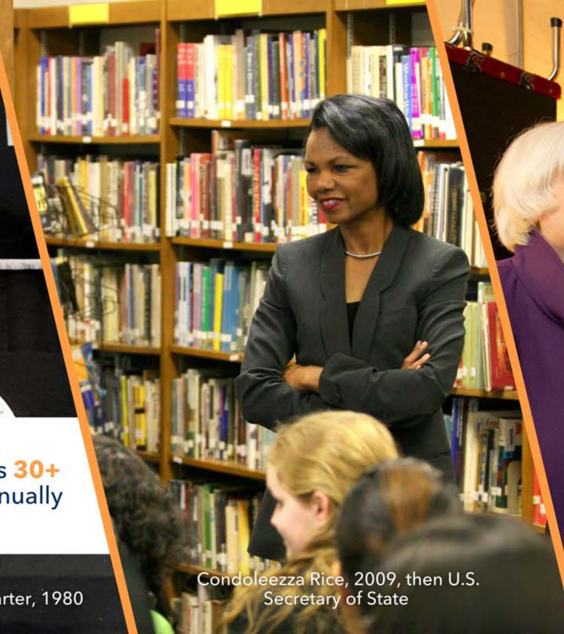
Condoleezza Rice, 2009, then U.S. Secretary of State