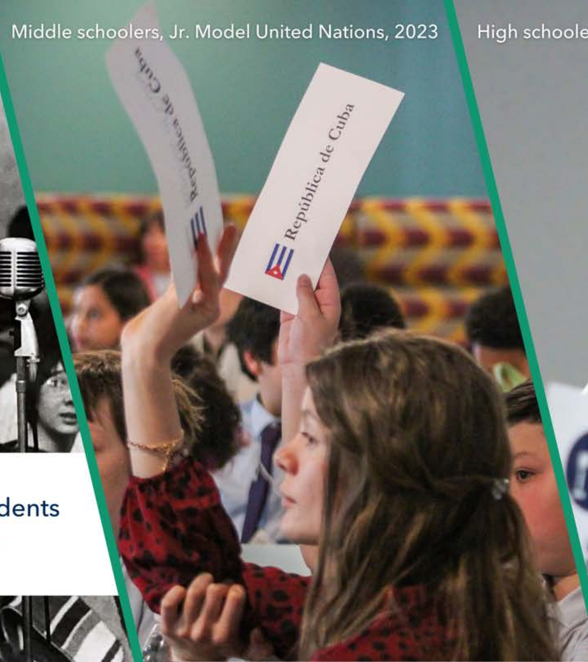
Middle schoolers, Jr. Model United Nations, 2023