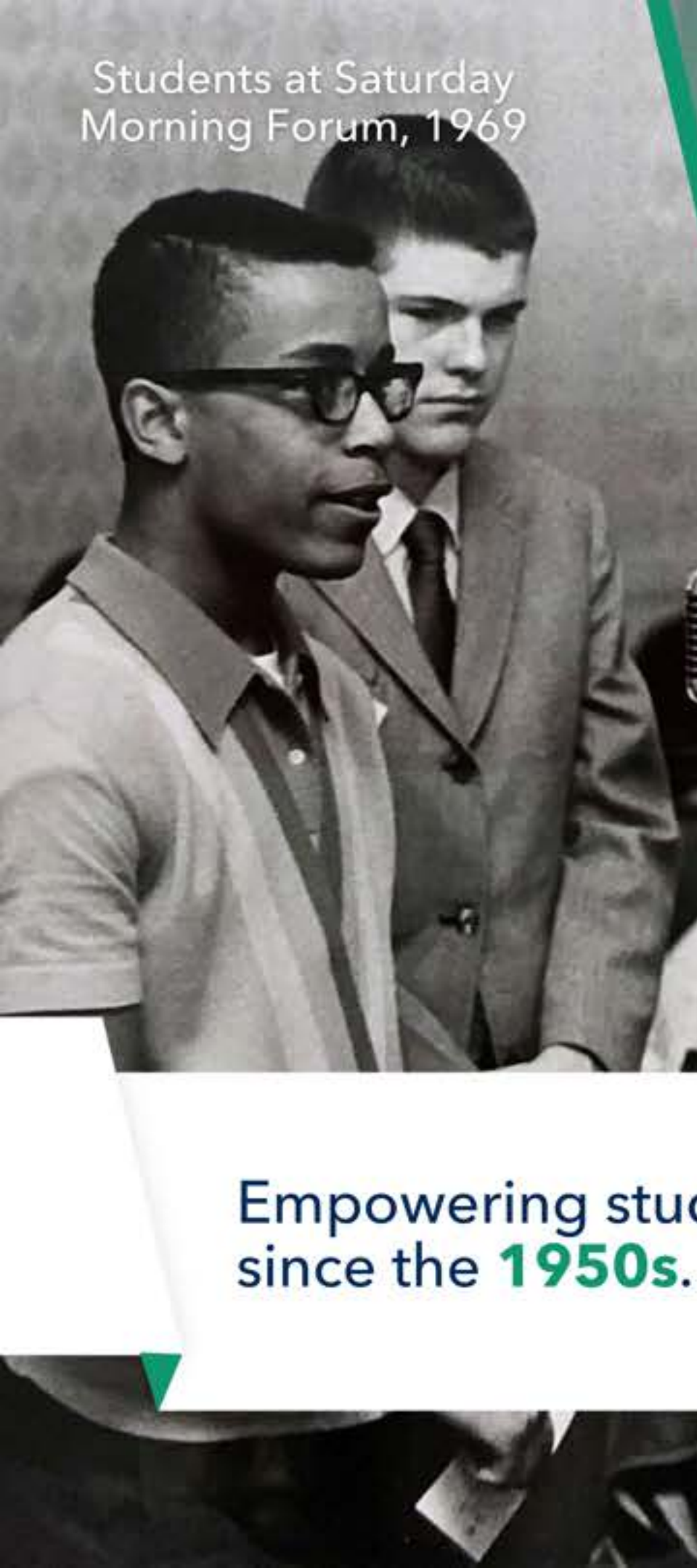
Students at Saturday Morning Forum, 1969