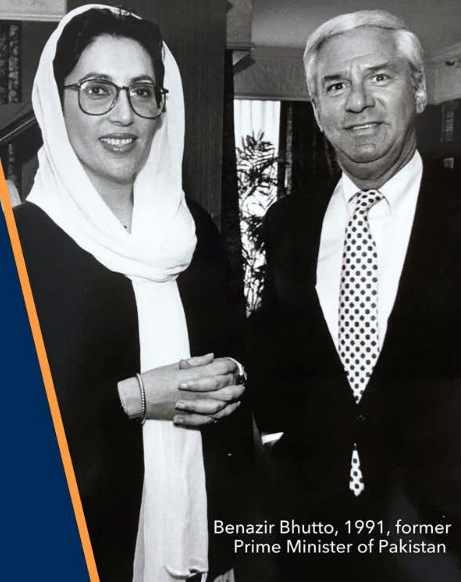
Benazir Bhutto, 1991, former Prime Minister of Pakistan

WHERE GLOBAL LEADERS SPEAK. WHERE PHILLY VOICES ARE HEARD.