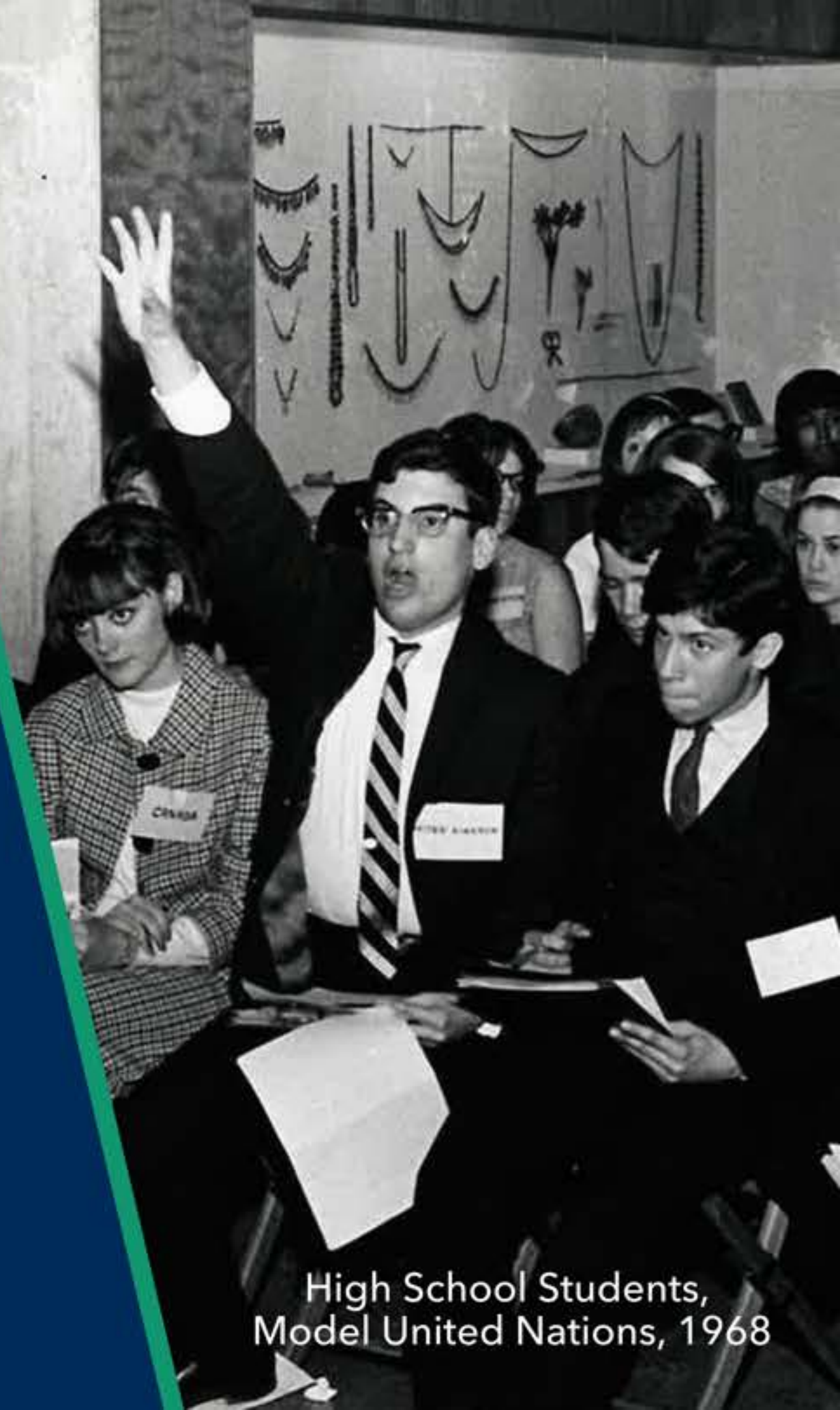
High School Students, Model United Nations, 1968

WHERE THE WORLD BECOMES ACCESSIBLE. WHERE GLOBAL CITIZENS ARE MADE.