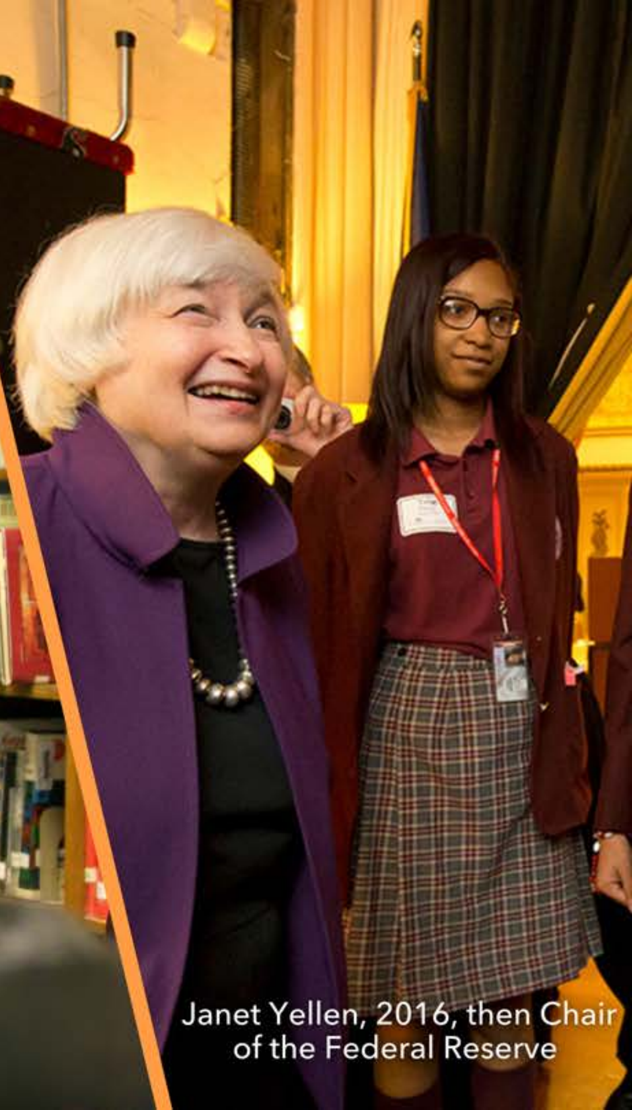
Janet Yellen, 2016, then Chair of the Federal Reserve