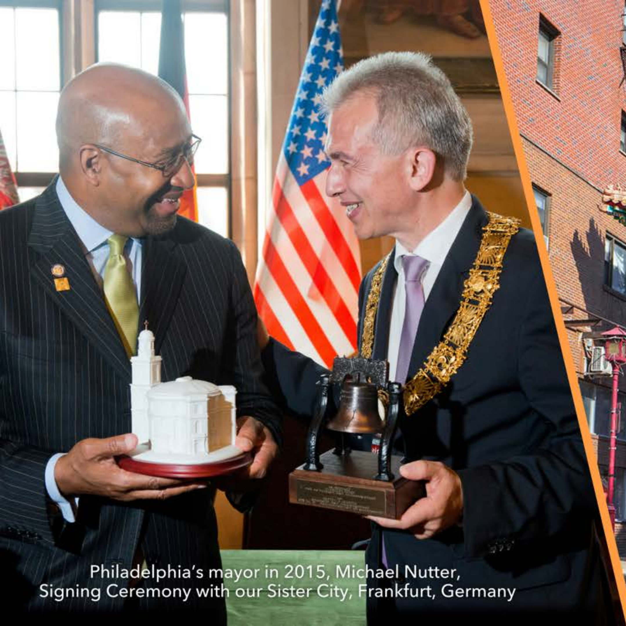
Philadelphia's mayor in 2015, Michael Nutter, Signing Ceremony with our Sister City, Frankfurt, Germany