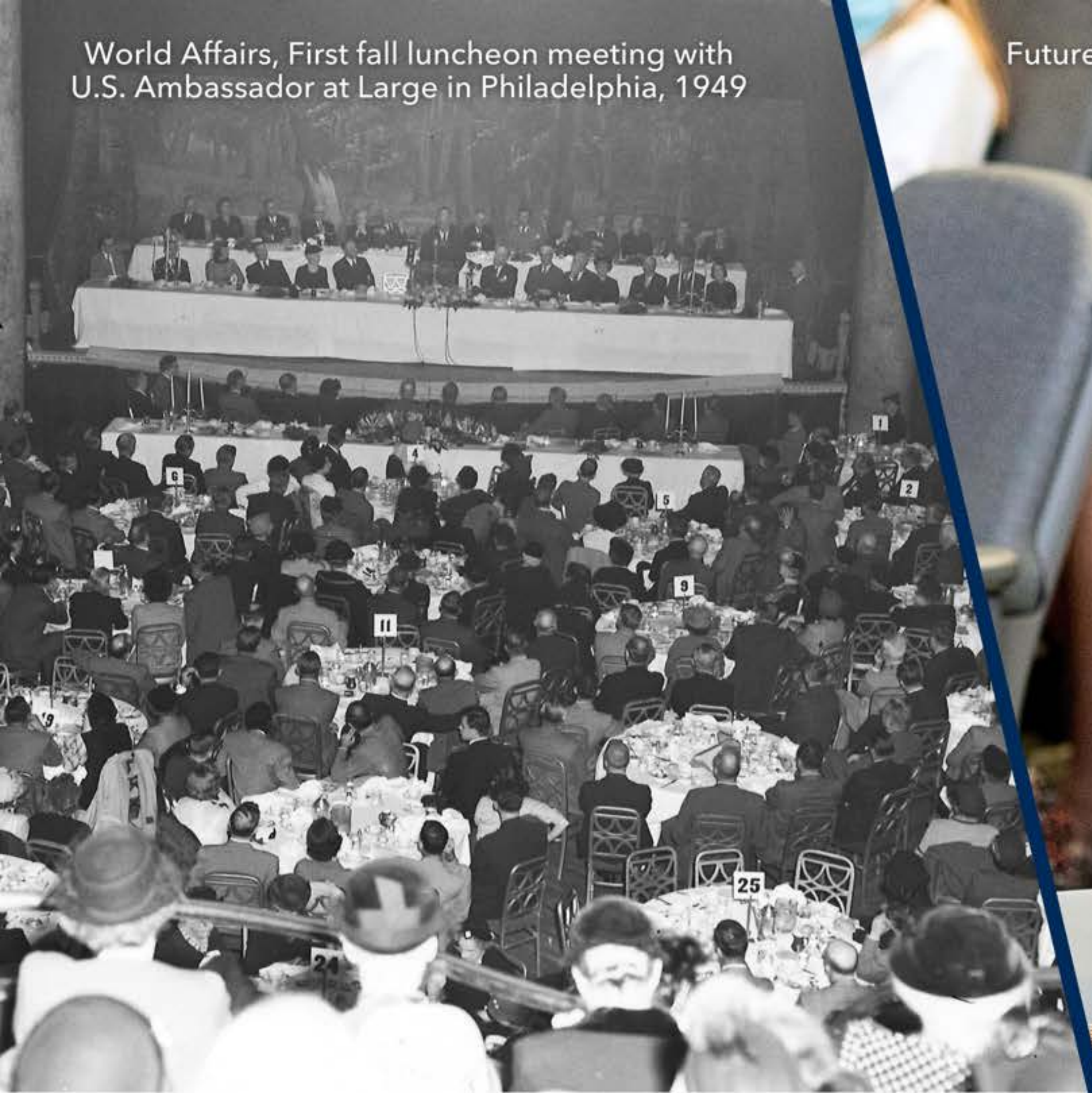
World Affairs, First fall luncheon meeting with U.S. Ambassador at Large in Philadelphia, 1949