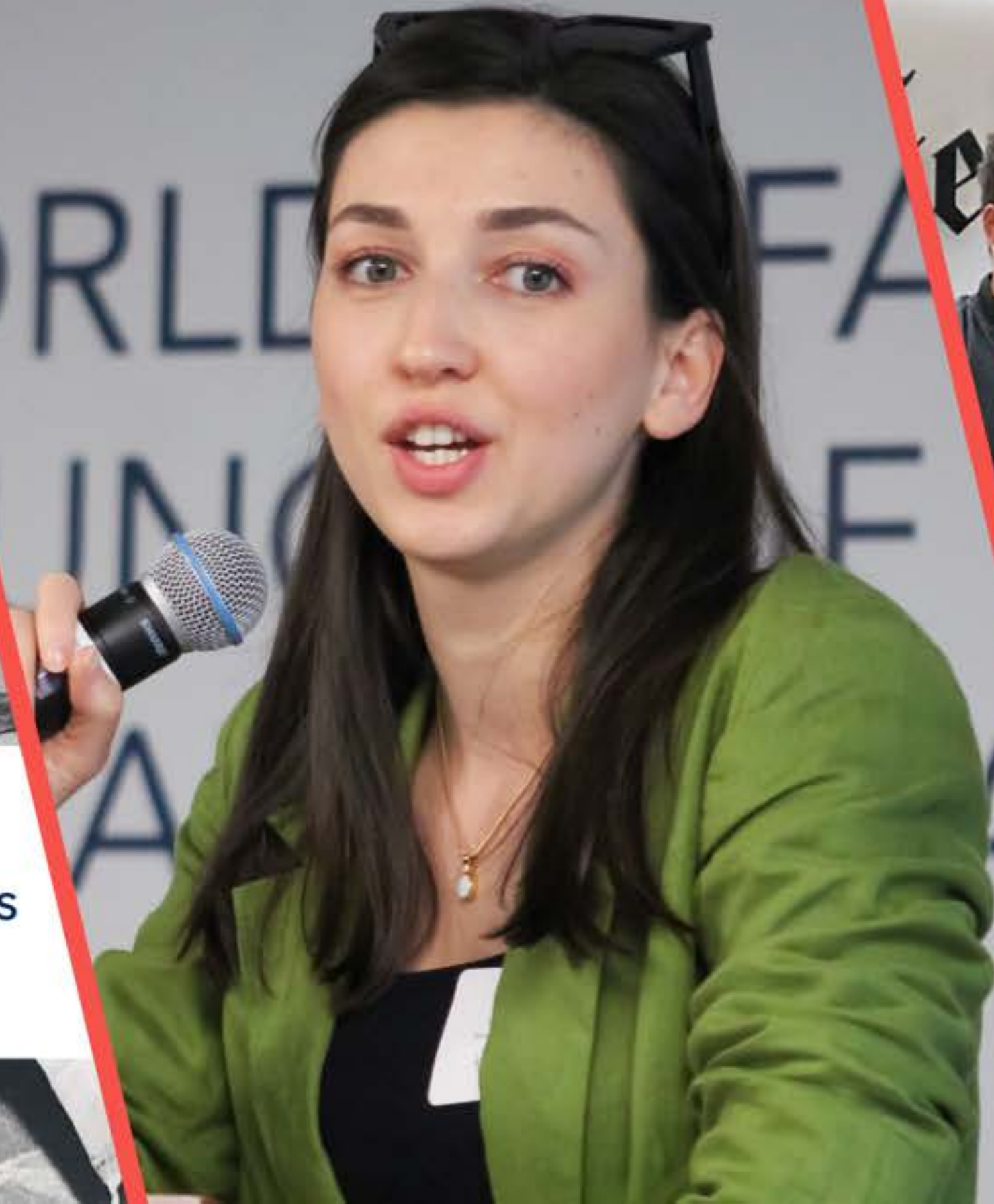
Journalist Delegation from Africa, Visits The Philadelphia Inquirer, 2024

World Affairs has welcomed 300+ leaders from 80+ countries!