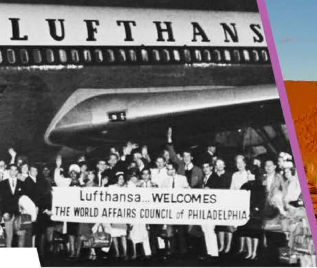
Lufthansa Rome Tour, 1960s

World Affairs sends 250+ travelers to 40+ countries.