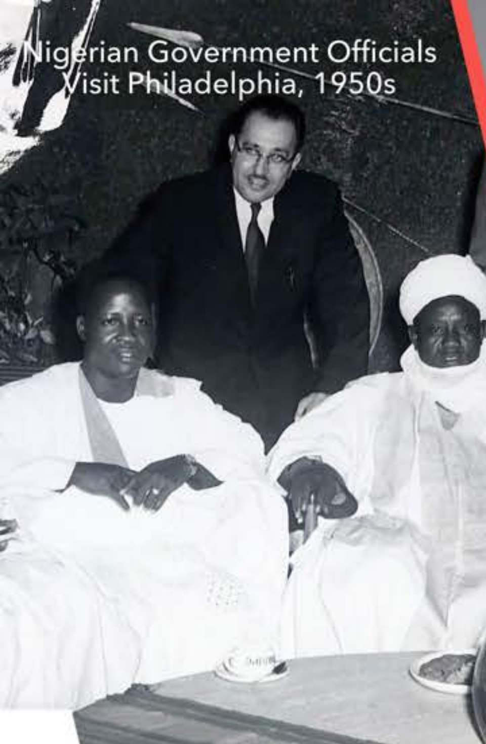
Nigerian Government Officials Visit Philadelphia, 1950s