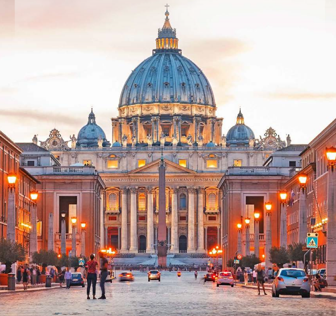
Above: St. Peter's Basilica, Vatican City