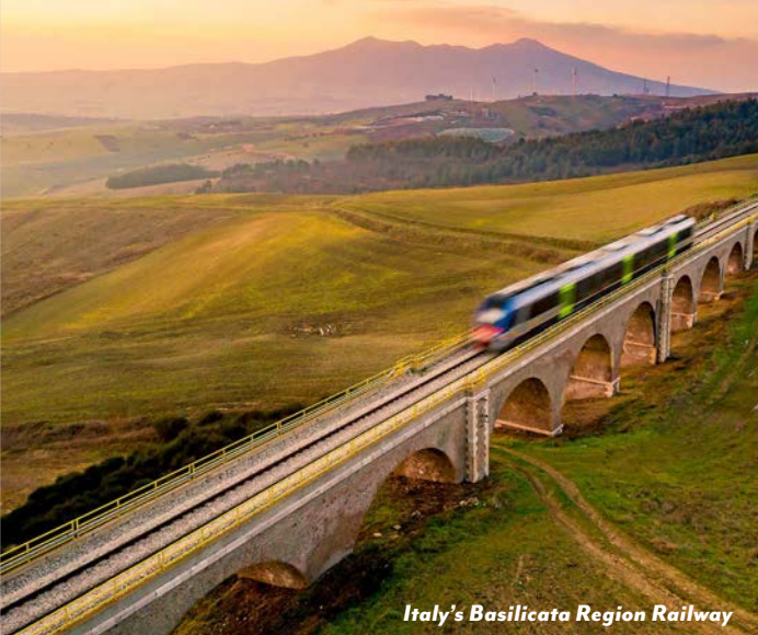
Italy's Basilicata Region Railway

a long history. Painted with bright colors and made to resemble cockerels, Cucù are believed to have magical powers and can be found in many homes in the area.