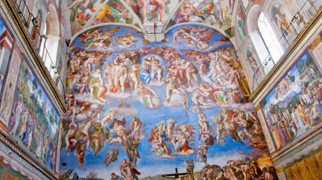
Sistine Chapel, Vatican City

design, and Michaelangelo created the vast dome. Take in the sights and ambience of St. Peter's Square on your own before returning to the hotel.