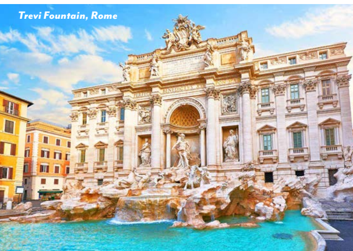
Trevi Fountain, Rome