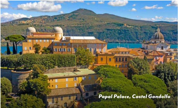
Papal Palace, Castel Gandolfo

early-morning opening of the Vatican Museum and witness the ritualistic unlocking led by the Clavigero. A private tour of the Vatican Museum follows the ritual. Awaken each gallery, including the Gallery of Candelabra, the Gallery of Tapestries and the Gallery of Maps before ending in the incomparable Sistine Chapel. Spend some quiet, reflective moments in the chapel. After breakfast, continue to the splendid St. Peter's Basilica. A new church was commissioned after the original shrine to St. Peter crumbled. All the great Roman Renaissance and baroque architects had input into its