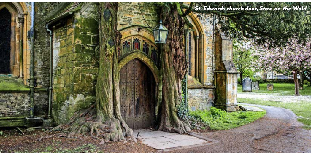
St. Edwards church door, Stow-on-the-Wold

Start the day with a guided walking tour of lovely Cheltenham. After lunch, depart for Hidcote, a world-famous Arts and Crafts-inspired garden covering over 10 acres