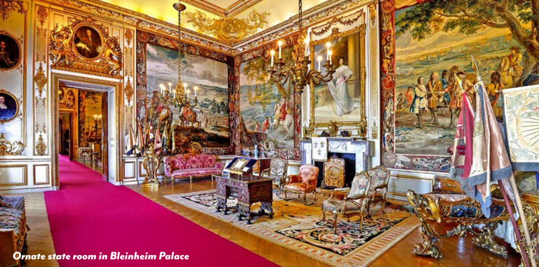
Ornate state room in Blenheim Palace

designed by Sir Christopher Wren and built in 1681 to house a bell (aptly named Great Tom). Step into the dark-paneled, portrait-lined dining hall with its vaulted ceilings, which may remind you of the Great Hall of Hogwarts. Finally, learn about “Christ Church time”—which is five minutes later than Greenwich Mean Time. Enjoy an included group dinner at a local eatery in Oxford.