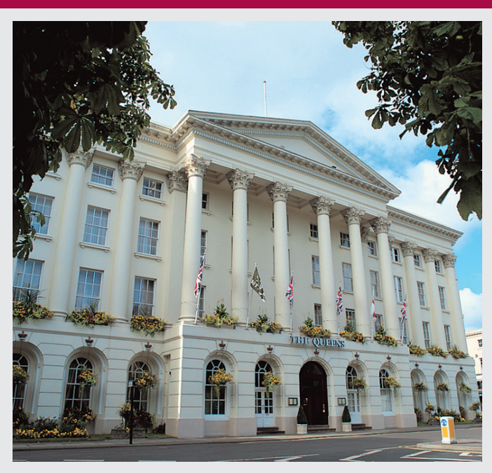
This exclusive hotel has been specially selected to enhance your experience.