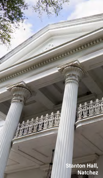
Stanton Hall, Natchez