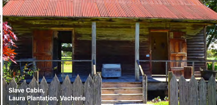
Slave Cabin, Laura Plantation, Vacherie