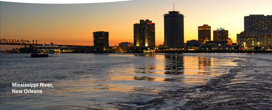
Mississippi River, New Orleans

Doris Kearns Goodwin has served as a consultant and has been interviewed extensively for PBS and the HISTORY Channel's documentaries on Presidents Johnson, both Roosevelts and Lincoln, the Kennedy family, and for Ken Burns' "The History of Baseball" and "The Roosevelts." Goodwin has received numerous awards for her books and career, including the inaugural American History Book Prize from the New-York Historical Society, the Gold Medal for biography from the American Academy of Arts and Letters, and most recently the Washington Irving Medal for Literary Excellence from the Saint Nicholas Society of the City of New York for An Unfinished Love Story . Goodwin graduated magna cum laude from Colby College and was invited to deliver the commencement address there in 2024. She earned a Doctor of Philosophy degree in Government from Harvard University, where she taught Government, including a course on the American Presidency.