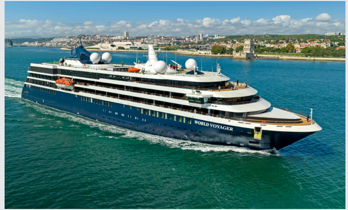
World Voyager Exclusively Chartered, Deluxe Small Ship