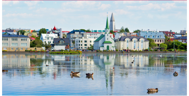
Reykjavik | 4 days, 3 nights August 4 to 7, 2026 | Program Begins: August 5