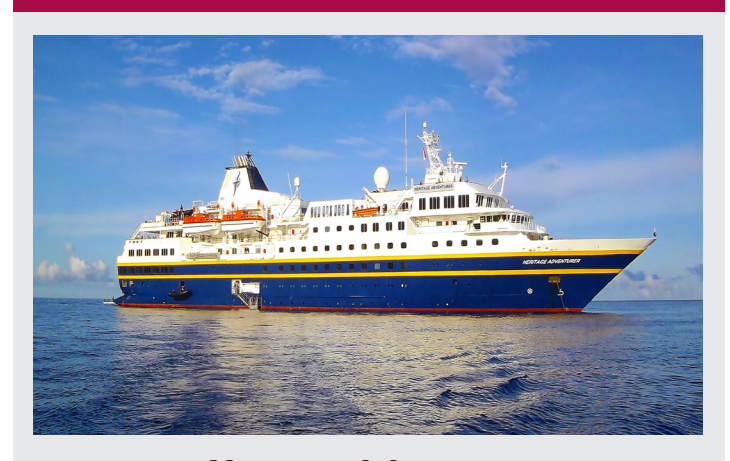
Heritage Adventurer Exclusively Chartered, First-Class Expedition Ship