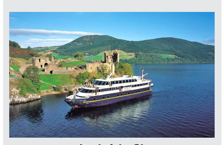
Lord of the Glens Exclusively Chartered, First-Class Small Ship

Sheraton Grand Hotel & Spa Edinburgh | Edinburgh