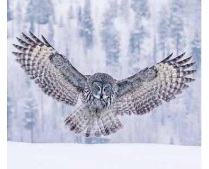
Great Grey Owl, Lapland