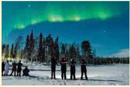
Northern Lights Village | Pyhä