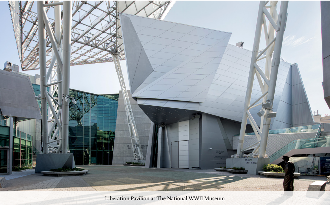
Liberation Pavilion at The National WWII Museum