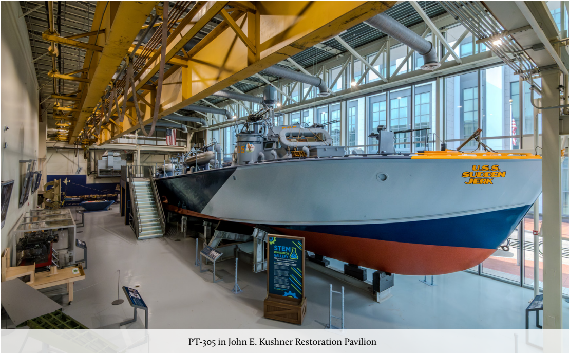
PT-305 in John E. Kushner Restoration Pavilion