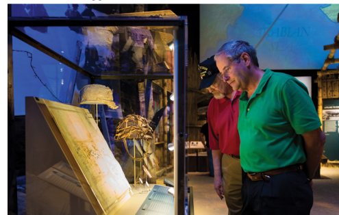
Road to Tokyo Galleries