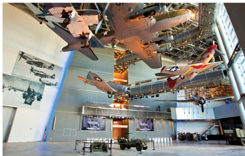
US Freedom Pavilion: The Boeing Center