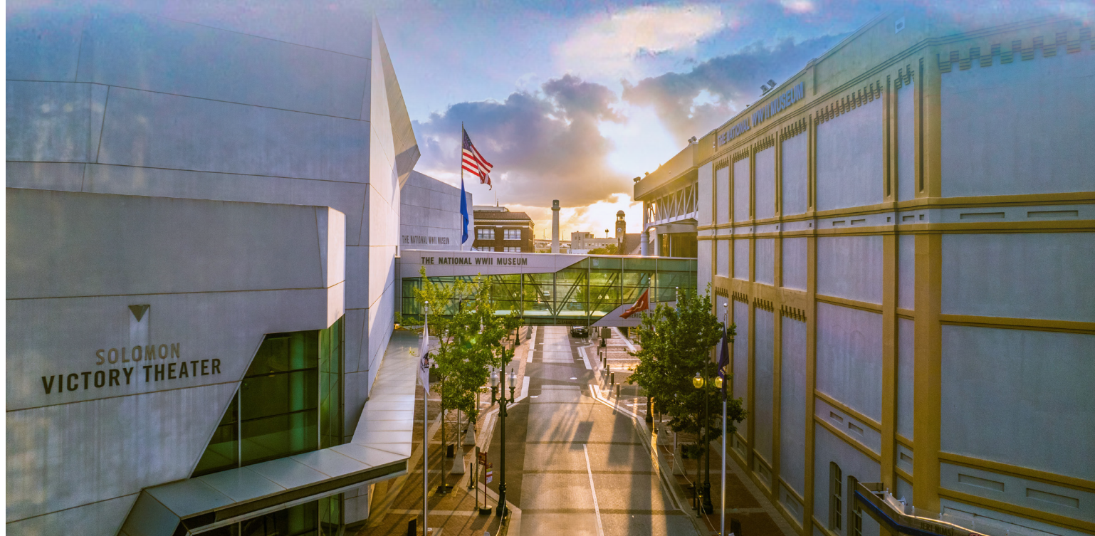
A view of Andrew Higgins Boulevard at The National WWII Museum