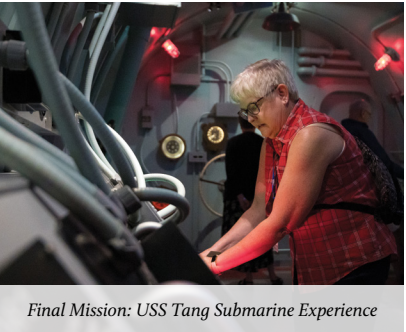
Final Mission: USS Tang Submarine Experience