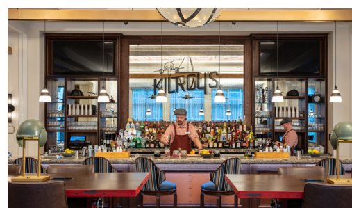
Kilroy's Restaurant and Bar

CALL: (800) 942-5004 | VISIT: WWW.WACPHILA.ORG | EMAIL: TRAVEL@WACPHILA.ORG