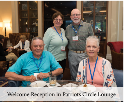
Welcome Reception in Patriots Circle Lounge