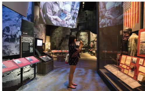
Road to Berlin Galleries