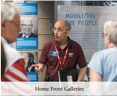
Home Front Galleries