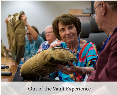
Out of the Vault Experience