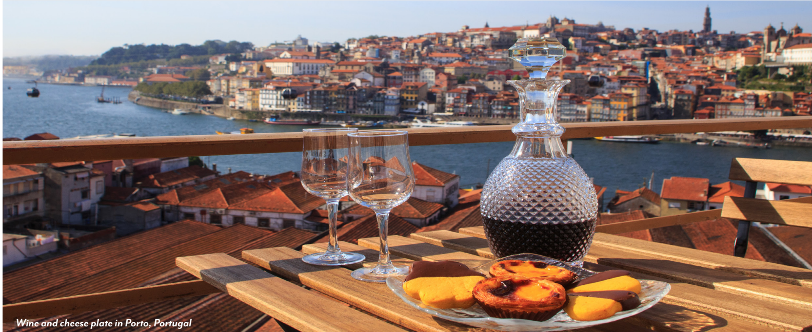
Wine and cheese plate in Porto, Portugal