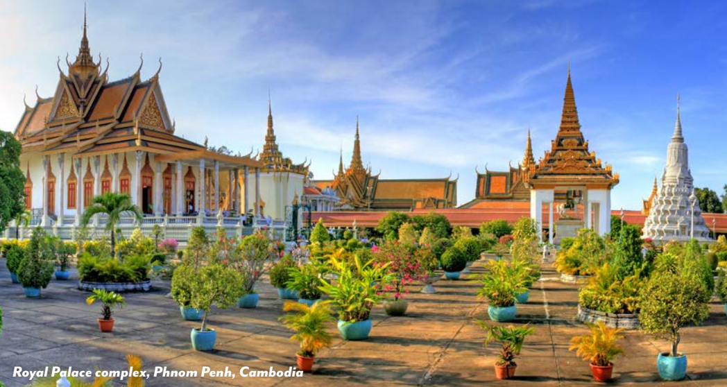
Royal Palace complex, Phnom Penh, Cambodia

friendly conversations with the villagers. Later, visit Prek Bangkong, known for its silk-weaving community. Observe artisans and weavers, and learn about the intricate silk production process.