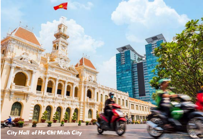
City Hall of Ho Chi Minh City