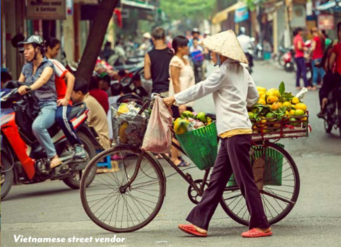
Vietnamese street vendor