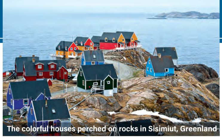
The colorful houses perched on rocks in Sisimiut, Greenland

in processing aluminum, was found in great quantities here, and the once incredibly productive mine played a crucial role in the Allies' production of aluminum for fighter planes during WWII. Walk among the Ivigtut's deserted buildings, see the enormous hole from which cryolite was mined, and pause at the above-ground cemetery used by the community until Ivittuut was abandoned. (B,L,D)