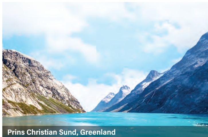
Prins Christian Sund, Greenland

After breakfast at the hotel, begin your exploration of Iceland with a visit to the geothermal fields on the Reykjanes Peninsula where powerful jets of steam escaping from deep below the Earth's