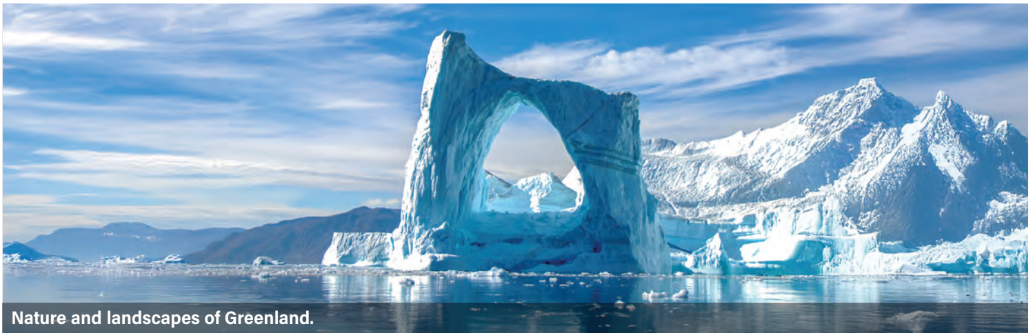
Nature and landscapes of Greenland.

After breakfast at the hotel, transfer to the airport for flights homeward. (B)