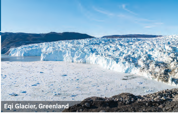
Eqi Glacier, Greenland