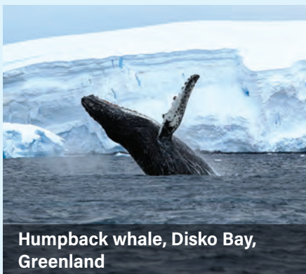
Humpback whale, Disko Bay, Greenland

NOT INCLUDED: International airfare; travel insurance; expenses of a personal nature; any items not mentioned in the itinerary or the above inclusions.