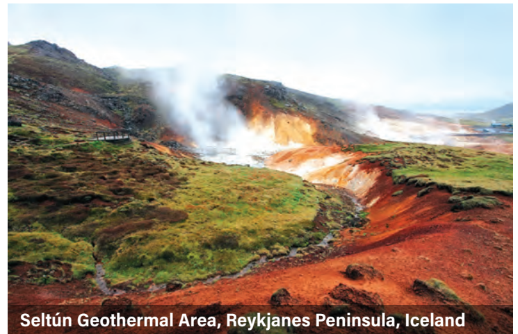
Seltún Geothermal Area, Reykjanes Peninsula, Iceland

Ivittuut (formerly Ivigtut) is an abandoned mining village built on the site of an ancient Norse settlement. Cryolite, a mineral used as flux