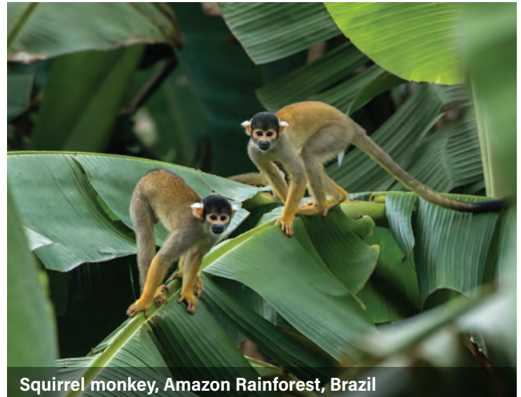
Squirrel monkey, Amazon Rainforest, Brazil

Wednesday, October 15 & Thursday, October 16