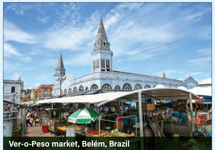
Ver-o-Peso market, Belém, Brazil