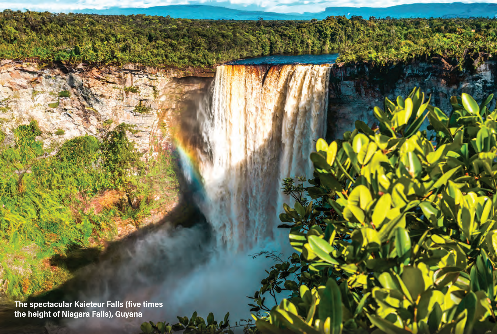
The spectacular Kaieteur Falls (five times the height of Niagara Falls), Guyana

Aboard the 76-Stateroom Expedition Cruise Ship VEGA