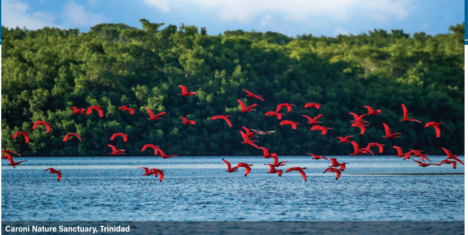
Caroni Nature Sanctuary, Trinidad

than 2,000 years ago, Europeans arrived in Suriname in 1499, when Amerigo Vespucci sailed along the country's coast. In 1651, British planters founded a permanent settlement, which they exchanged with the Dutch for their village of New Amsterdam, which became Manhattan. Suriname remained a Dutch colony until 1954, when it became a self-governing state, gaining full independence in 1975. The long Dutch presence is evident in the architecture of Paramaribo, the capital, which is located on the banks of the Suriname River, declared a UNESCO World Heritage Site. Beautiful buildings from the Dutch colonial era line squares and many streets. Explore the city, including Palm Garden, a leafy park created in 1682 and home to more than 1,000 palms; Fort Zeelandia, built in the 17th century, now housing the Stichting Surinaams Museum, which exhibits colonial-era artifacts; and the fascinating Central Market. We will also drive to the nearby Commewijne District, an attractive area crisscrossed with creeks and rivers, known for its former plantations and rich wildlife. (B,L,D)