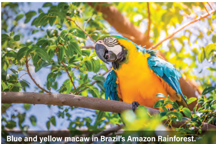
Blue and yellow macaw in Brazil's Amazon Rainforest.

Enjoy the ship's excellent facilities and attend lectures as the Vega cruises along the northeast coast of South America. (B,L,D)