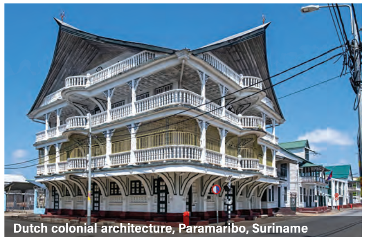
Dutch colonial architecture, Paramaribo, Suriname

Originally populated by Arawaks and other ethnic groups more