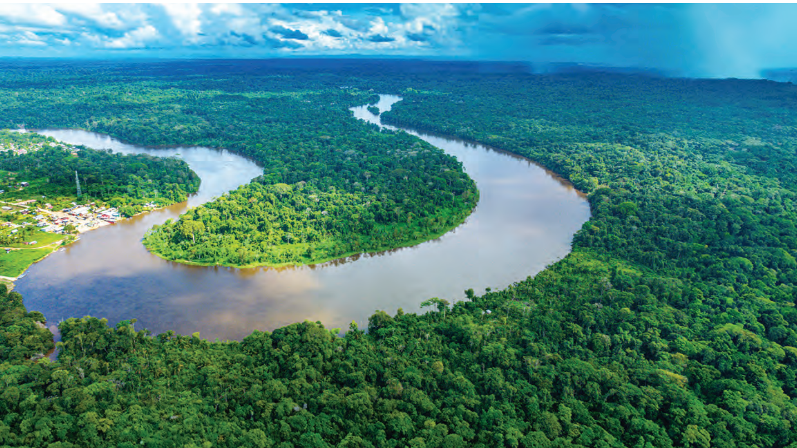
Suriname River, Suriname