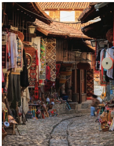
Kruja old market bazaar souvenir shops in Albania.

Today also presents an alternative option for travelers. Those interested in birding can visit the lagoons of Divjakë-Karavasta National Park, home to over 200 avian species, including the greater flamingo, Kentish plover, and the extremely rare Dalmatian pelican. (B,L,D)