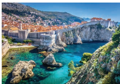
Dubrovnik's Old City.