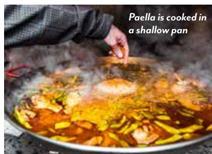
Paella is cooked in a shallow pan

Another popular dish native to the region is couscous , which has roots in Morocco and is prepared from ground wheat rolled into pellets. Experience these savory cultural staples firsthand on our tour with a cooking demonstration and lunch in Tangier, Morocco, and an optional trip to the market in Valencia, followed by a paella cooking class with a local chef.