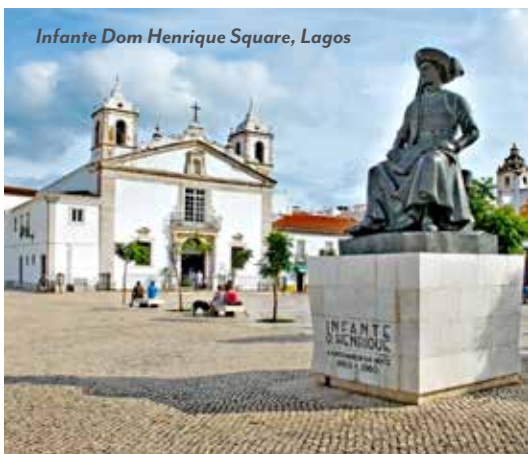
Infante Dom Henrique Square, Lagos

After breakfast, disembark the ship and transfer to the Barcelona Post-Tour or travel to the airport in Barcelona for your return flight home. (B)