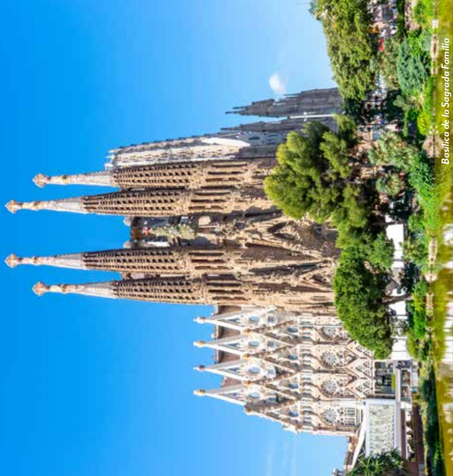
Basilica de la Sagrada Família

Early Booking Savings* available | Save $2,000 per couple!