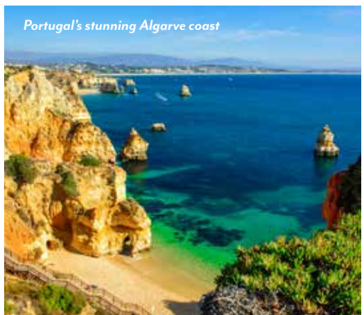
Portugal's stunning Algarve coast