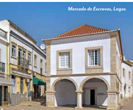
Mercado de Escravos, Lagos

A scenic drive takes you to Granada, where you may explore