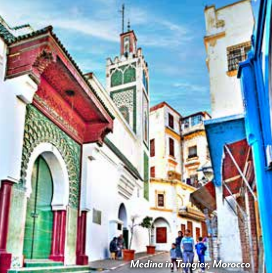
Medina in Tangier, Morocco