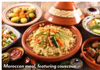
Moroccan meal, featuring couscous