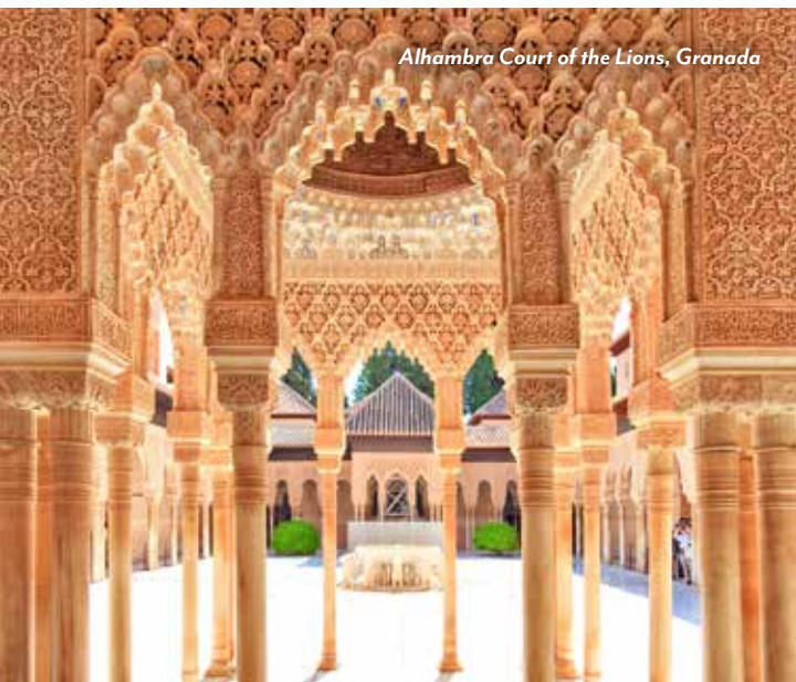
Alhambra Court of the Lions, Granada

Discover the architectural treasures and interconnected history of Portugal, Morocco and Spain, revealed through their fortified medieval towns and coastal cities. The cross-continental collaboration and joint influences of Greco-Roman, Judeo-Christian and Moorish civilizations ushered in a new era of advances in mathematics, science, medicine, horticulture and philosophy — creating the catalyst for global trade from the 15th through 18th centuries. Ships sailing from these shores to the New World brought back riches to the region, generating great wealth among this unique mélange of cultures and sparking a veritable renaissance in art and architecture. From the coasts of Portugal and Spain to the ancient maritime port of Tangier, Morocco, experience the allure of these seaside gems as you retrace voyages in the wake of mariners past.