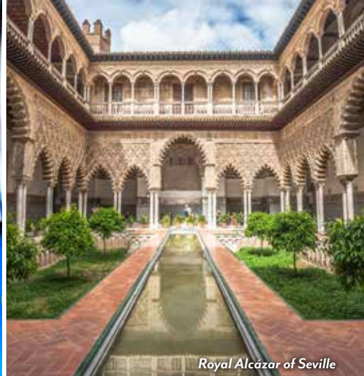
Royal Alcázar of Seville

the Alhambra Palace and its magnificent Generalife gardens —collectively a UNESCO World Heritage site. Originally designed as a military area, the Alhambra became the residence of the royal court of Granada in the middle of the 13th century, and later a citadel with high ramparts and defensive towers. Admire the exquisite detail that made it both an artistic treasure and a hilltop stronghold. (B,L,D)