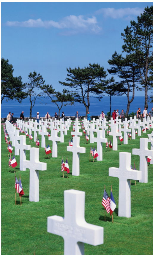
On Day 12, we visit the American Cemetery at Omaha Beach.