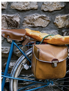
Typical French scene

Day 13: Crépon/Giverny/Paris This morning we visit the village of Giverny and the home and gardens of Impressionist artist Claude Monet. Here we see the familiar lily pond and wisteria-covered Japanese footbridge of Monet's paintings, as well as his home, now restored to its original design. Then we travel to Paris, reaching our hotel late afternoon. We are free for dinner on our own in this culinary capital. B