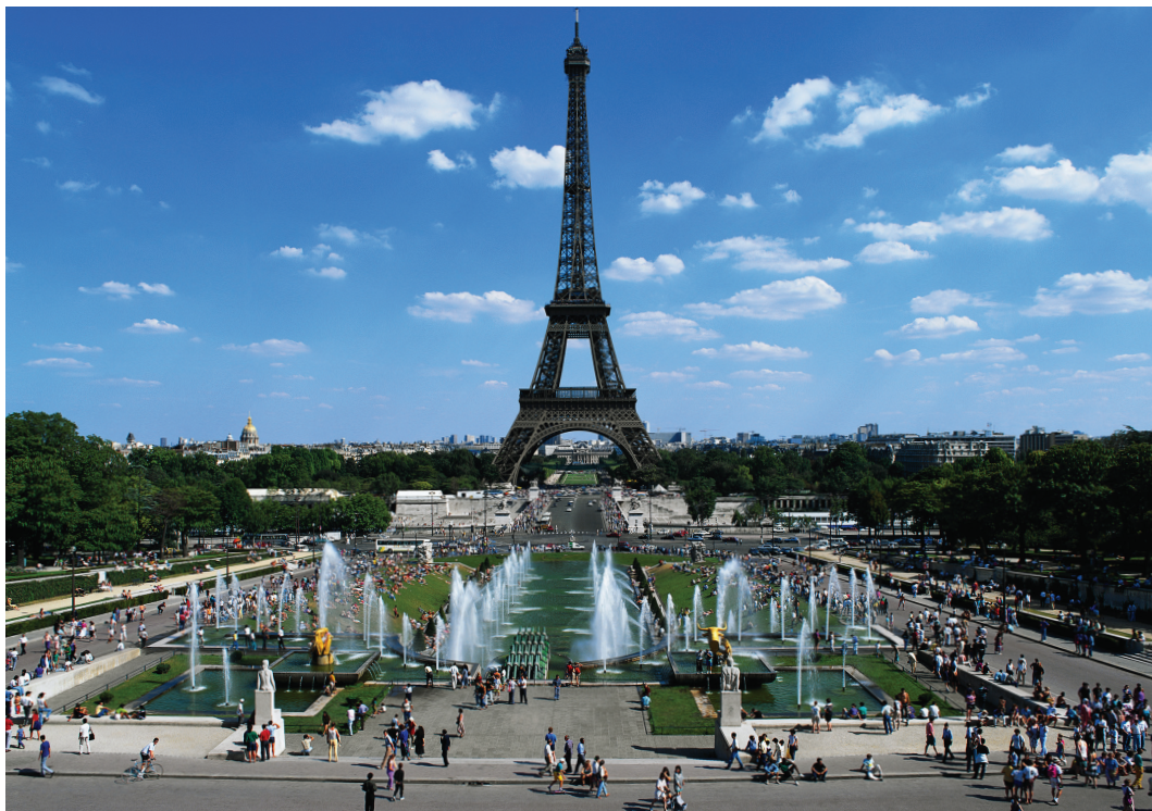
Discover Paris with its iconic Eiffel Tower.

some of Sarlat's museums or art galleries – or simply to wander the atmospheric cobblestone streets. After lunch on our own we visit nearby Rocamadour, a revered pilgrimage site and medieval village whose three tiers cling almost impossibly to a sheer limestone cliff. We take a guided walking tour then enjoy some free time before we return to Sarlat mid-afternoon. Dinner tonight is on our own. B