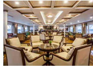
SUNDECK INDOOR LOUNGE