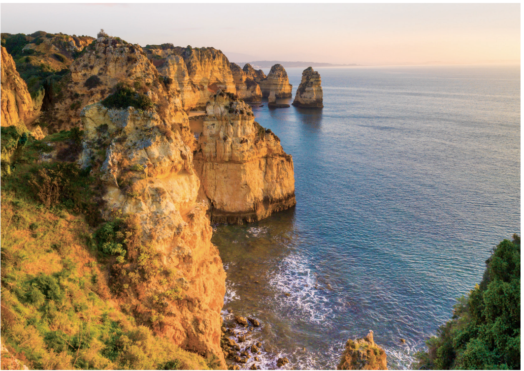
We see the Ponta da Piedade rock formations on Day 11.

tour include the medieval city center, a UNESCO site, and the baroque Clérigos Church, with its signature bell tower. Then we enjoy a private “six-bridge” cruise on the Douro, upon whose banks the Romans planted grape vines millennia ago. Our tour ends with a visit to a port lodge for a tasting of the fortified wine exclusive to this region. The remainder of the day is free to enjoy this fascinating city as we wish, perhaps to wander the narrow cobbled streets of the medieval Ribeira (riverside) district – or to stroll the broad boulevard and public square of Praça da Liberdade, flanked by imposing civic buildings and trendy boutiques. We dine together tonight. B,D