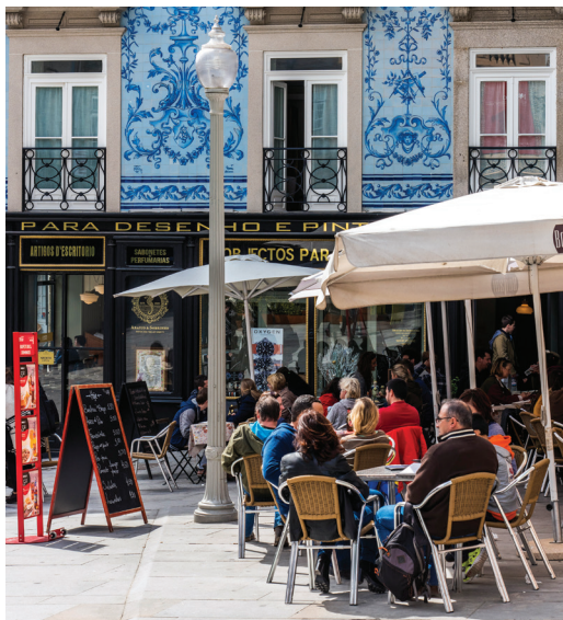
Café life in Portugal

Cape of Good Hope and beyond. It was Prince Henry the Navigator who sponsored these expeditions; much of our touring in the historical town of Lagos and in Sagres today celebrates his legacy. Our explorations begin with a cruise along the limestone coastline, featuring the dramatic rocks of Ponta da Piedade. Next, we visit the Antonine Museum inside the Church of St. Anthony, see the statue of Prince Henry the Navigator, and stop at the Ponta da Piedade and Cape St. Vincent viewpoints to witness the dramatic Atlantic as it nears shore at mainland Europe’s southernmost point. Then we return to Sagres for an afternoon at leisure before we gather for dinner together. B,D