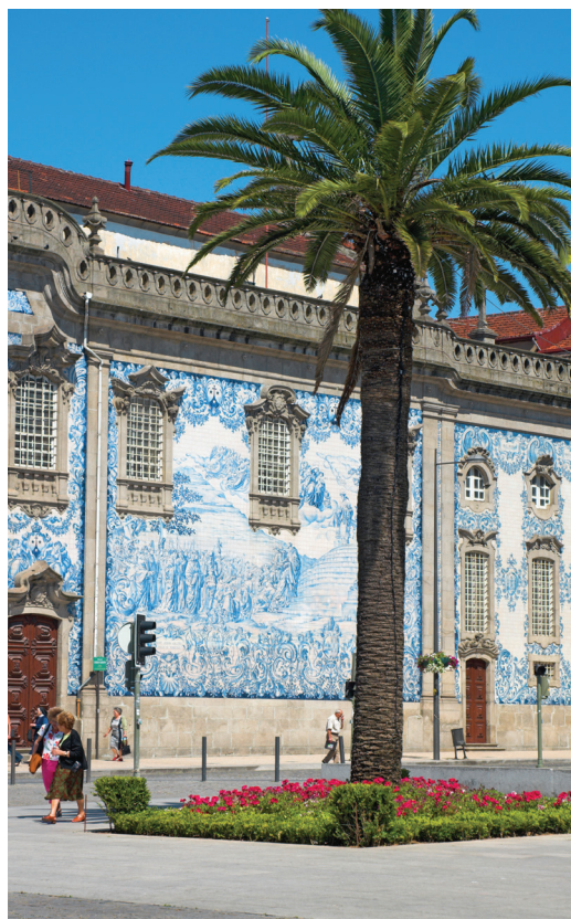
Signature Azulejo tiles in Oporto

Day 12: Sagres/Lisbon We embark on a leisurely drive back to Lisbon today, stopping for lunch on our own along the way. After reaching our hotel in a restored 19 th -century palace mid-afternoon, we have time at leisure until we gather to celebrate our discoveries at tonight’s farewell dinner. B,D