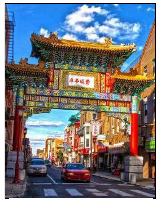
Tianjin's Gift to Philadelphia: Chinatown's Friendship Gate

As a proud partner of the City of Philadelphia's Sister Cities program, World Affairs collaborates closely with Tianjin's international leaders to create economic, educational, cultural, and diplomatic opportunities for citizen diplomats each year. As Sister Cities, Philadelphia & Tianjin engage in the exchange of delegations comprising political and business leaders, cultural representatives, educators, technical experts, and students. World Affairs takes great pride in bridging connections between Philadelphia residents and Tianjin, fostering invaluable exchanges and global understanding. By joining this tour, you will be a first-person witness to people-to-people diplomacy between the two most powerful nations in the world. Overnight at the ASTOR HOTEL. (B, Reception, D)