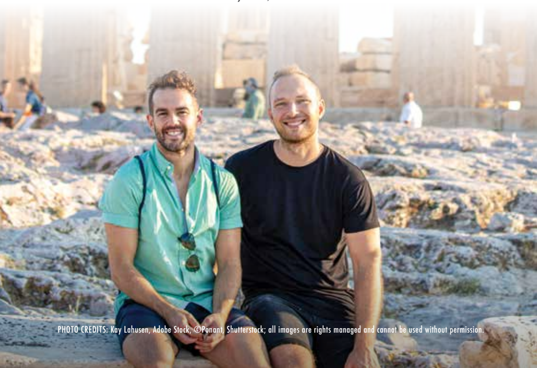
PHOTO CREDITS: Kay Lahusen, Adobe Stock, ©Ponant, Shutterstock; all images are rights managed and cannot be used without permission.

Front cover: World-famous windmills in Mykonos, Greece