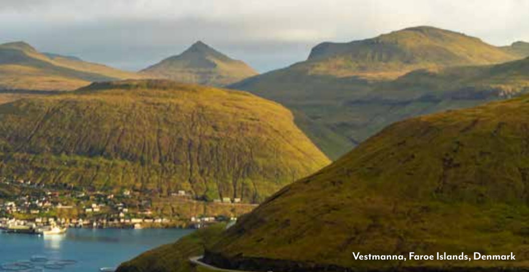
Vestmanna, Faroe Islands, Denmark