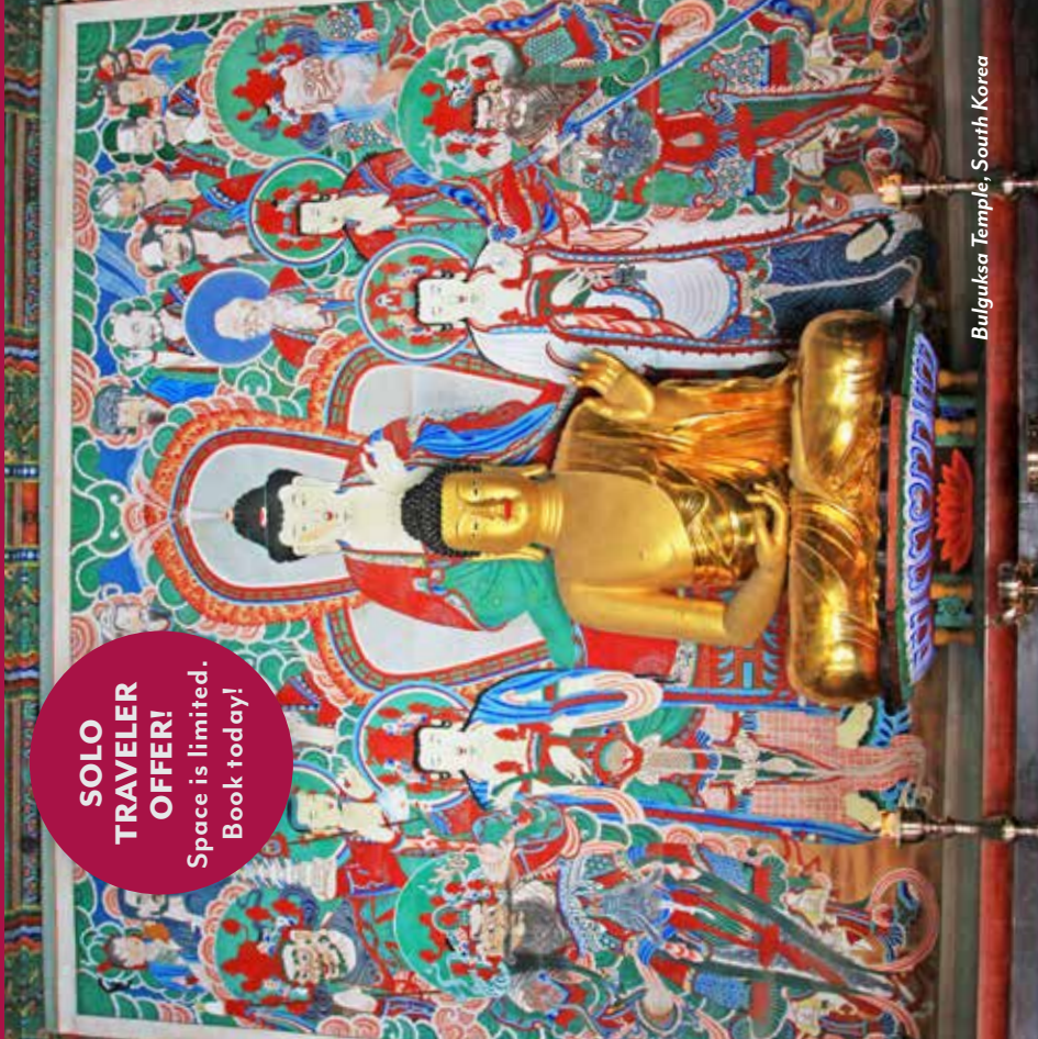
Bulguksa Temple, South Korea

PRSR1 STD U.S. Postage PAID Gohagan & Company