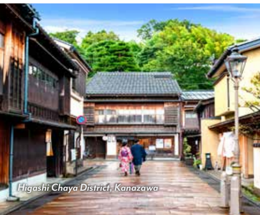
Higashi Chaya District, Kanazawa

Explore UNESCO-inscribed Hagi, a well-preserved