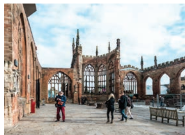
Cathedral Church of Saint Michael in Coventry