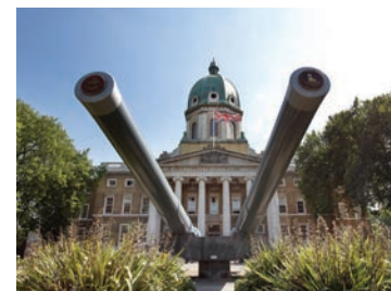
Imperial War Museum