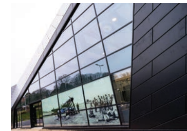
Battle of Britain Bunker