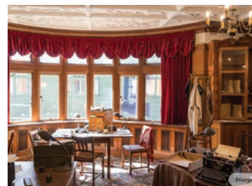
Bletchley Park Mansion