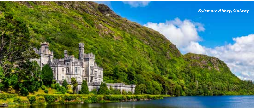
Kylemore Abbey, Galway

After breakfast, disembark and transfer to the airport for your return flight home. (B)