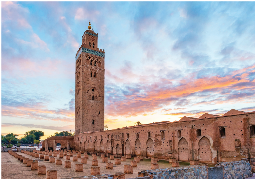
We see the distinctive Koutoubia Mosque – Marrakech’s largest – on Day 11.

Day 6: Fez Today we tour the old Mellab (Jewish quarter) and its 17 th -century synagogue and the royal gates. Then we walk through the Fez medina , where we see some hidden treasures, including the Blue Gate, the most picturesque of the Old City’s historic gates; the medieval school of Bouanania; the 12 th -century home of Jewish scholar Maimonides; and the authentic food market. The remainder of the afternoon is free for independent exploration and lunch on our own. B,D