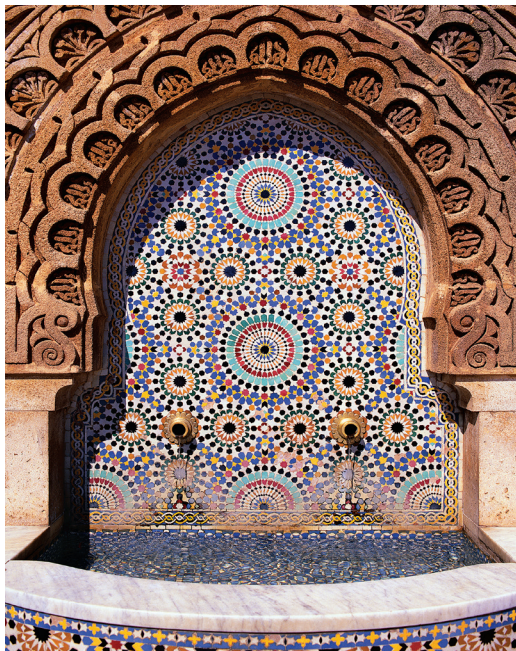
Traditional Moroccan tile work

Day 10: Ouarzazate/Ait ben-Haddou/Marrakech En route to Marrakech today, we stop first at uninhabited Ait ben-Haddou, a UNESCO World Heritage site and one of southern Morocco’s most scenic villages that is often used as a location for fashion and film shoots. Its old section consists of deep red kashabs packed together so tightly they appear to be a single