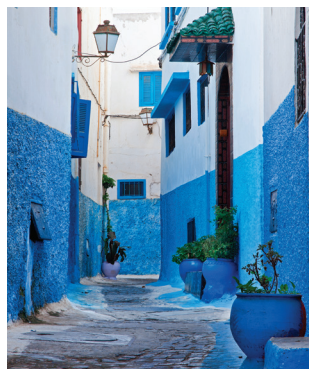
Rabat's Kasbah des Oudaias

Day 13: Marrakech/Casablanca We leave Marrakech this morning by coach for storied Casablanca, Morocco's