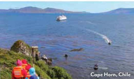
Cape Horn, Chile

While sailing toward Indonesia's fabled Spice Islands in 1520, Portuguese explorer Ferdinand Magellan became the first European to enter the channel that would later bear his name. Along the south side of the strait, amid the world's southernmost forests, smoke rose from numerous native Selk'nam campfires, leading Magellan to name this island Tierra del Humo, "land of smoke," which Spain's King Charles V changed to the more poetic Tierra del Fuego, "land of fire." The northern side of the strait came to be known as Patagonia, "land of giants," for Magellan and his men's impression of the tall, indigenous inhabitants. Three centuries later, the HMS Beagle, under the command of Admiral Robert FitzRoy and with young naturalist Charles Darwin on board, became the first ship to sail east to west through its namesake channel. Experience the same wonder of these intrepid explorers as you cruise through these mesmerizing landscapes almost untouched since Magellan explored them nearly 500 years ago.