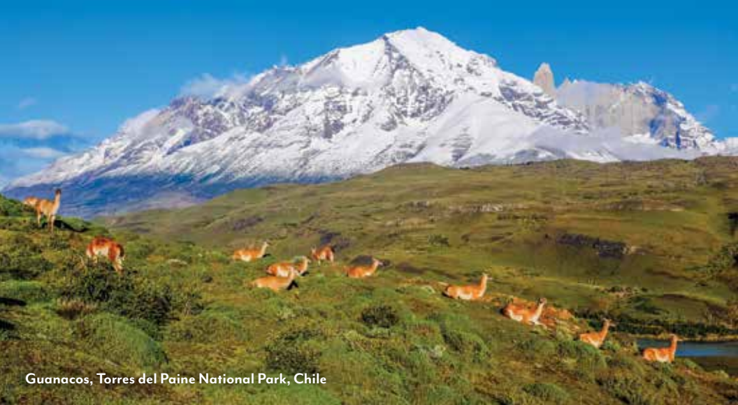
Guanacos, Torres del Paine National Park, Chile