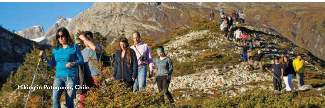
Hiking in Patagonia, Chile

Torres del Paine is South America's most celebrated national park and a UNESCO Biosphere Reserve. Observe its pristine landscape, brimming with spectacular glaciers, lakes and mountain ranges. Search for the region's iconic wildlife — ostrich-like rheas, pumas and guanacos. In nearby Milodón Cave, 1890s German pioneer Herman Eberhard discovered the prehistoric remains of a 13-foot giant sloth. Enjoy a hike along the gentle shores of Grey Lake, admiring the inspiring granitic towers and Grey Glacier. Relax over lunch in the park and survey its spectacular mountaintop views, including the three-peaked Cordillera del Paine. (B,L)