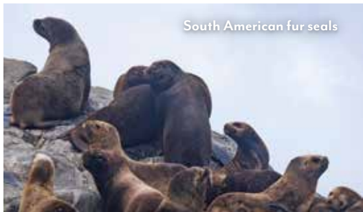
South American fur seals