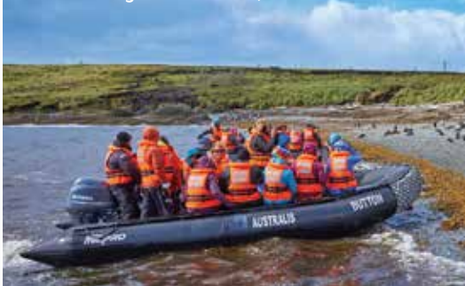
Zodiac landing at Tucker Islets, Chile

After breakfast, disembark in Ushuaia and fly to Buenos Aires to depart for your home city. Arrive home the next day. (B)