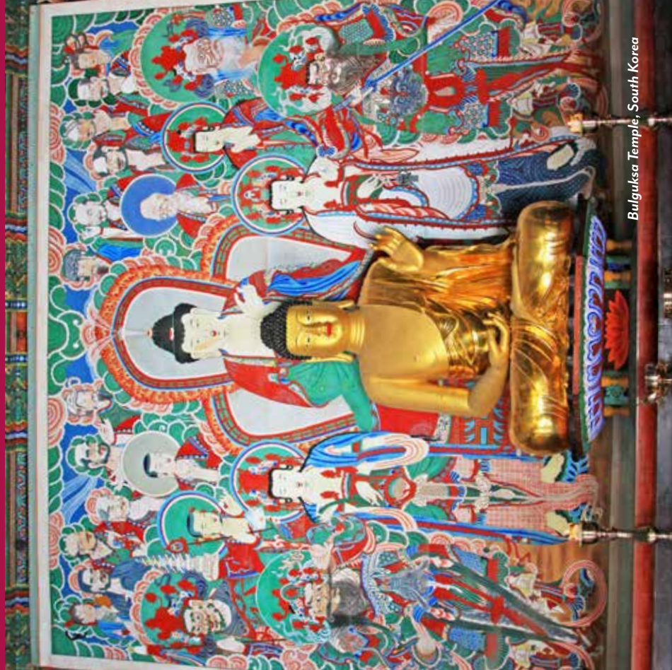
Bulguksa Temple, South Korea

PRSR1 STD U.S. Postage PAID Gohagan & Company