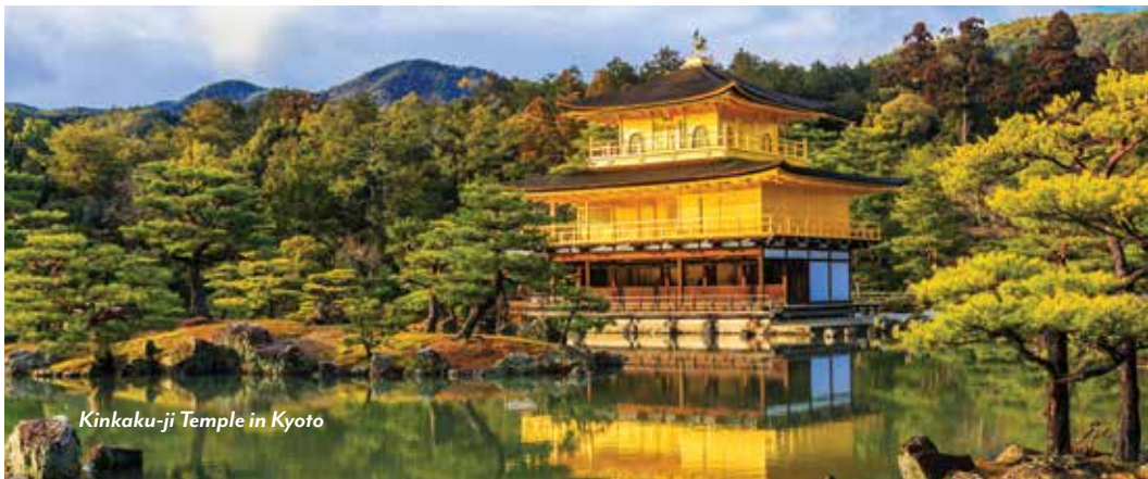
Kinkaku-ji Temple in Kyoto

Disembark in Osaka and transfer to the airport for your return flight home. (B)