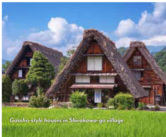
Gassho-style houses in Shirakawa-go village