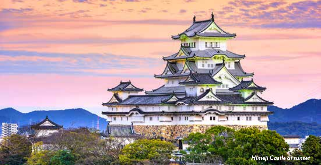
Himeji Castle at sunset