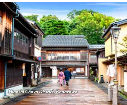
Higashi Chaya District, Kanazawa

Explore UNESCO-inscribed Hagi, a well-preserved