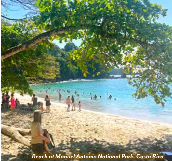
Beach at Manuel Antonio National Park, Costa Rica

Explore the island on a guided beach walk or a snorkeling adventure. (B,L,D)