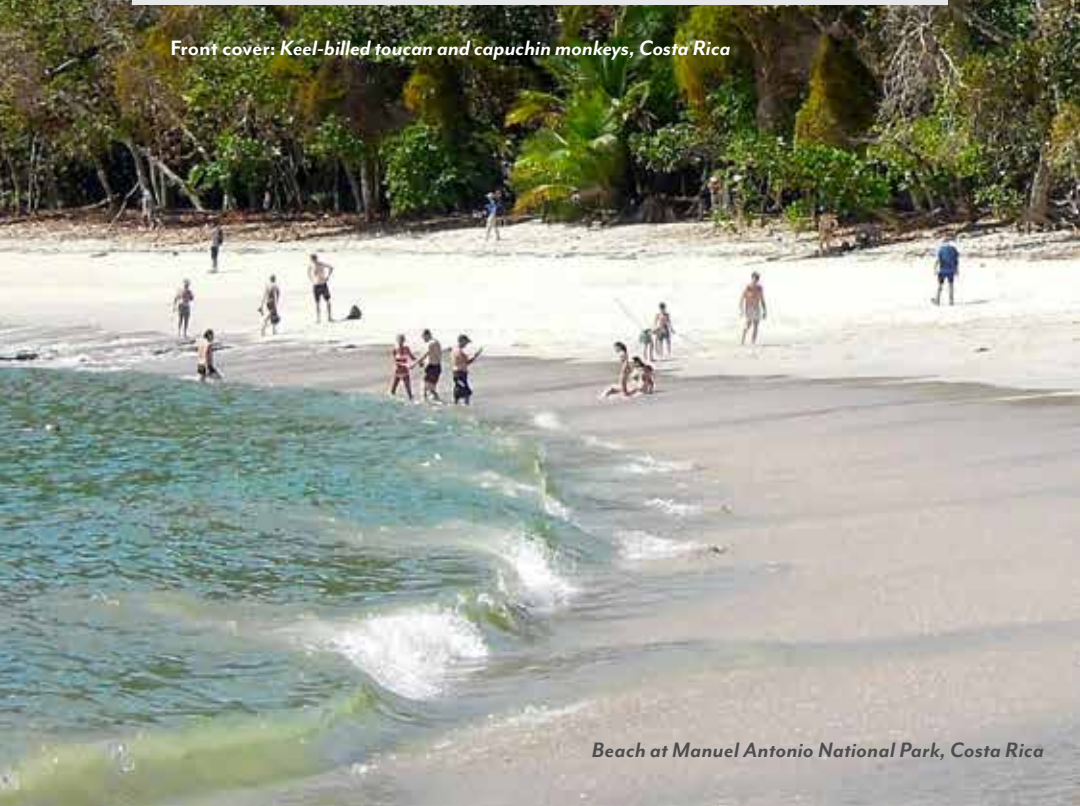
Beach at Manuel Antonio National Park, Costa Rica

Front cover: Keel-billed toucan and capuchin monkeys, Costa Rica