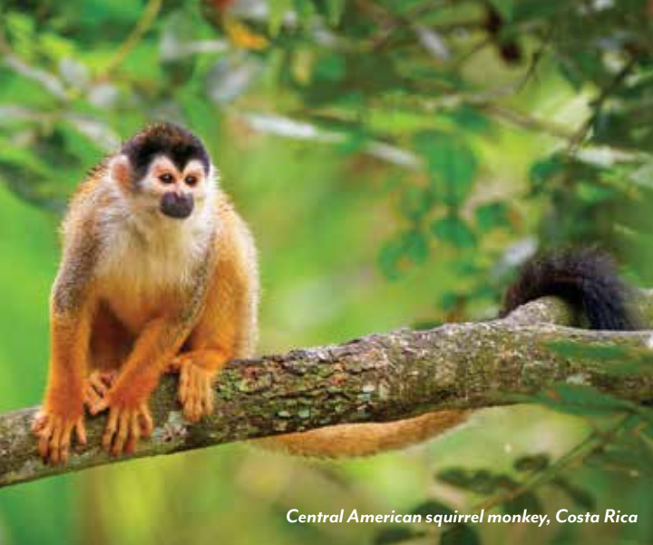
Central American squirrel monkey, Costa Rica