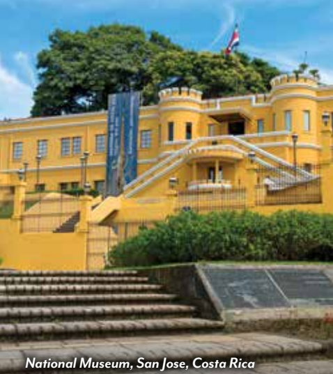
National Museum, San Jose, Costa Rica