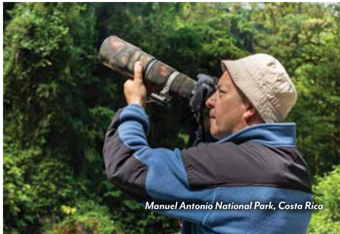
Manuel Antonio National Park, Costa Rica