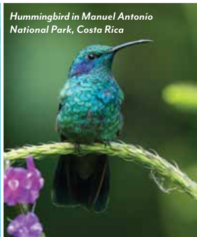
Hummingbird in Manuel Antonio National Park, Costa Rica