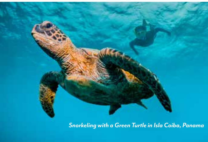
Snorkeling with a Green Turtle in Isla Coiba, Panama

This island is part of Coiba National Park, a UNESCO World Heritage site. An astounding range of wildlife calls this area home, including agoutis, howler monkeys, giant toads and green iguanas. The clear turquoise waters support bottlenose dolphins, giant seahorses and numerous species of shark and whale.