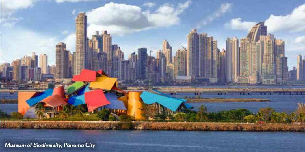
Museum of Biodiversity, Panama City