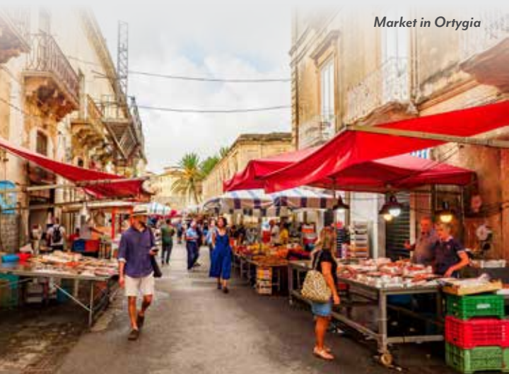
Market in Ortygia

Immerse yourself in Sicily's rich street food culture with savory snacks that can easily be enjoyed on their own. Starting in Palermo, panelle is one of the most established street market dishes, made from chickpea flour, water, salt, and sometimes parsley or other herbs. The mixture is fried into thin, crispy fritters that are often served on a roll or as a snack on their own. Deep-fried rice balls called arancini are filled with a variety of ingredients like meat, cheese, vegetables, and sometimes seafood. The rice is typically mixed with saffron and coated in breadcrumbs before being fried to perfection. For a fluffier alternative, crocchette are made of mashed potatoes, eggs, and cheese that are rolled into balls, breaded, and fried until crispy. These comfort food delights also can be filled with a variety of ingredients like ham, mushrooms, or spinach for added flavor. You would be remiss to pass up a taste of pani câ meusa, a signature Sicilian sandwich filled with chopped veal spleen—boiled in broth and seasoned with salt, lemon, and parsley—served on a sesame seed bun and optionally topped with ricotta or caciocavallo cheese. If you can't get enough of these delectable eats on the streets of Palermo, you also can stave off hunger with these Sicilian staples while exploring Ortygia's markets.