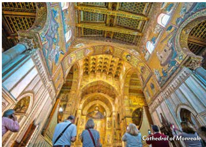
Cathedral of Monreale

of Trapani and continue to Segesta. See the ancient and well-preserved Doric Temple, with 36 gold limestone columns as well as an amphitheater still in use today. Visit the medieval town of Erice, set atop a hill surrounded by a lush park and accessible via cable car.