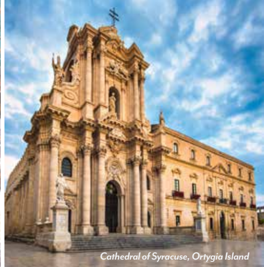
Cathedral of Syracuse, Ortygia Island

Islamic world. The capital has a history dating back to 200 B.C. Transfer to the UNESCO World Heritage Site of Carthage to visit the Baths of Antonino, the ancient Roman theater, and the Punic ports where Carthaginian fleets once took shelter. See Tunis's historic center, the Arabic Medina or Old Town—also a UNESCO-inscribed site with a labyrinth of narrow alleyways, small shops, mosques, and palaces. Enjoy afternoon free time in the souks (markets) after an included lunch at a local restaurant near Medina. (B,L,D)