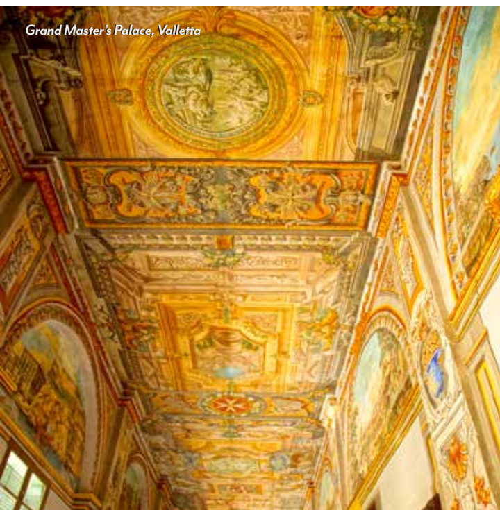
Grand Master's Palace, Valletta

Further details will be provided with your reservation confirmation.