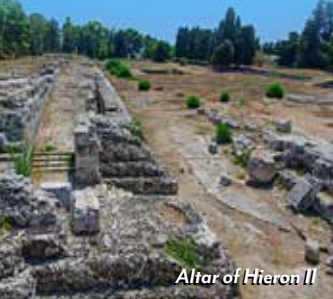
Altar of Hieron II

Centuries-old ruins beckon you to step into mythical pasts as sparkling turquoise waters ensconce pastel-hued towns and villages on this extraordinary itinerary. Each destination in Italy, Sicily, Malta, Tunisia, and Carthage reveals an intriguing history and distinct character—luring explorers, artists, architects, and powerful rulers for generations. The world's greatest empires are etched into every incomparable landscape and architectural triumph. It is a rare opportunity to see the diverse cultural legacies of the Italians, Greeks, Goths, Moors, Normans, Castilians, Turks, Jesuits, Spanish, and French come to life among timelessly spectacular scenery.