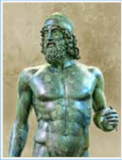
A Riace Bronze Statue