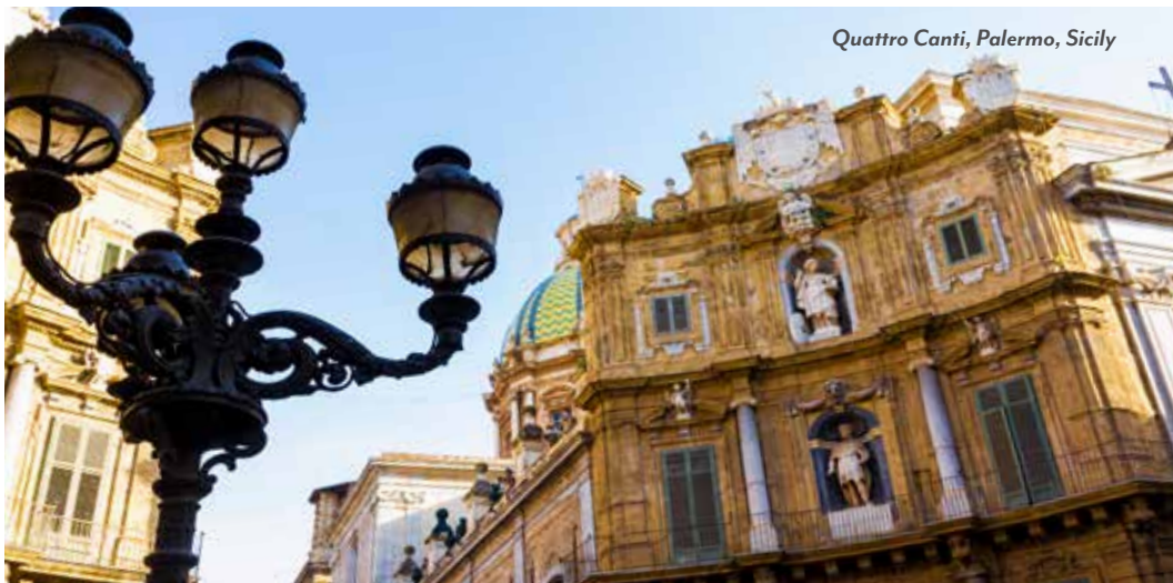
Quattro Canti, Palermo, Sicily

Enjoy breakfast on the ship and travel to the airport for your return flight home. (B)