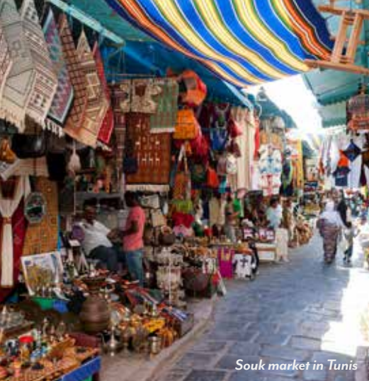
Souk market in Tunis