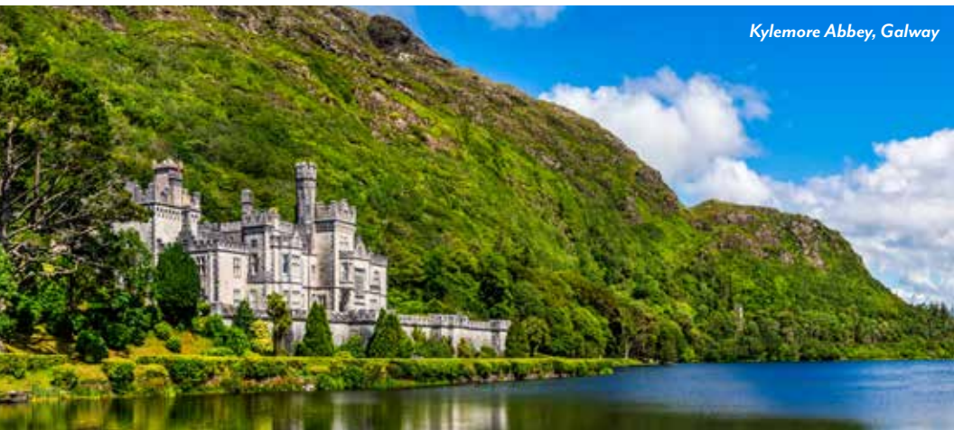
Kylemore Abbey, Galway

After breakfast, disembark and begin the County Kilkenny Post-Program Option or transfer to the airport for your return flight home. (B)