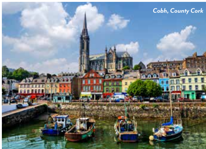
Cobh, County Cork

Arrive in Galway and select from two included excursions. On the first choice, admire the Wild Atlantic Way's dramatic splendor at the Cliffs of Moher and The Burren. Enjoy a guided walk across The Burren's karstic landscape and watch waves crashing below you at the breathtaking cliffs that rise 702 feet above the ocean. Your other option takes you to