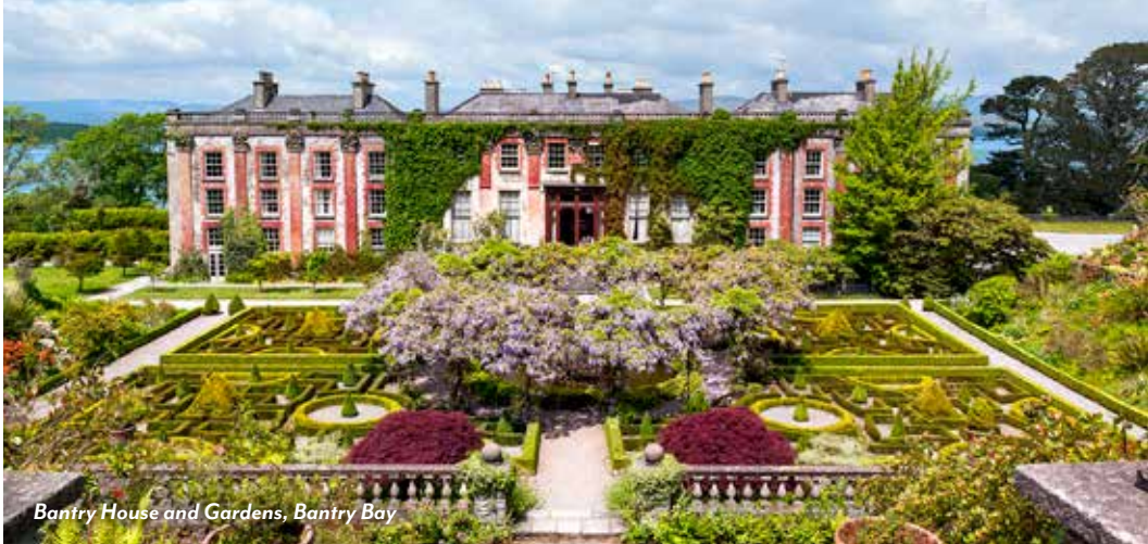
Bantry House and Gardens, Bantry Bay