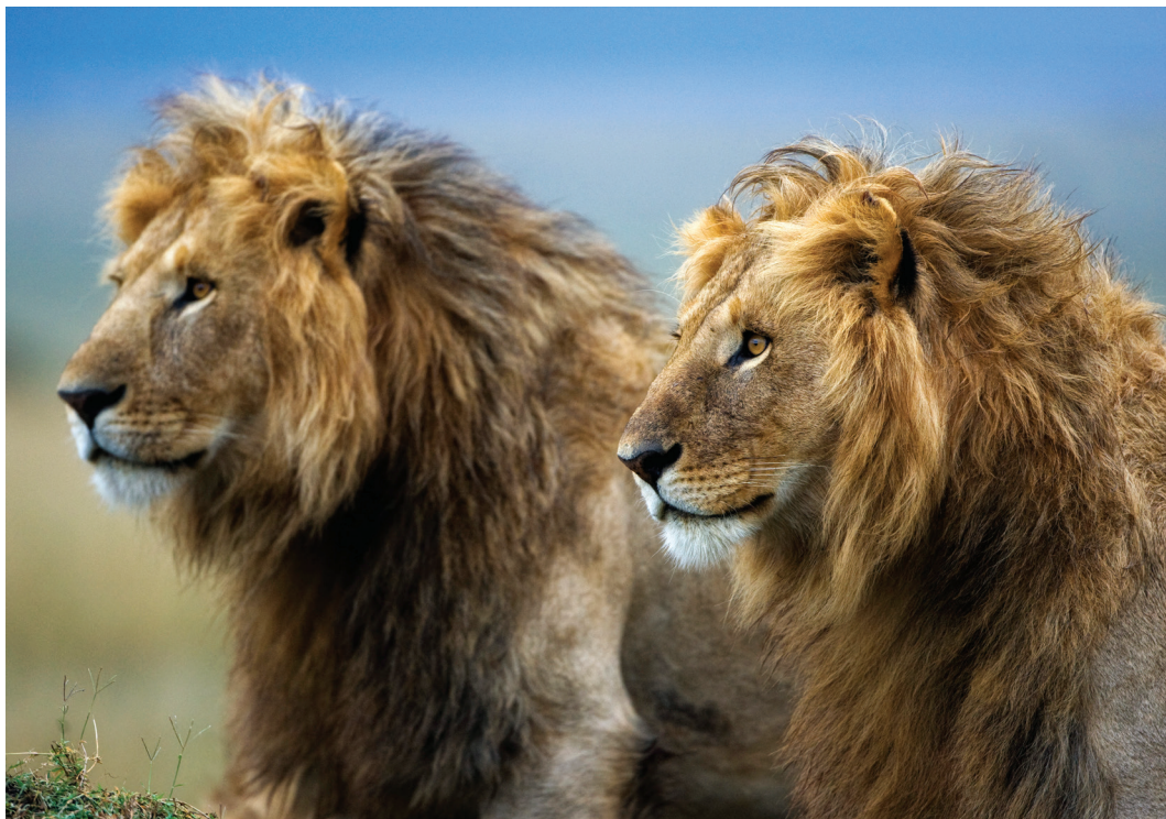
More than 3,000 lions roam the Serengeti.

the world's largest intact and perfectly formed volcanic caldera. The unique biosphere here has remained unchanged for eons; towering walls encircle the crater's floor which represents Africa in microcosm: grassland, swamps, lakes, forests, and some 25,000 mammals, including elephant, black rhinoceros, lion, hippo, and zebra. Then we return to our lodge for an afternoon at leisure. B,L,D