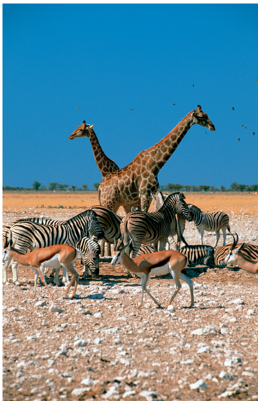
Tarangire National Park teems with diverse wildlife.

Day 10: Serengeti We embark on more wildlife drives today. We have the chance to see some – or all – of Africa's “Big Five:” lion, Cape buffalo, elephant, rhino, and leopard, along with wildebeest, zebra, eland, gazelle, and other plains animals, and some 500 species of birds. B,L,D