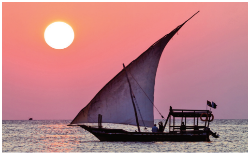
Traditional dhow sails off Zanzibar.

Day 13: Zanzibar/Dar es Salaam/Depart for U.S. This morning we take a quick flight to Dar es Salaam, Tanzania’s largest city. Upon arrival, we will have a day room at a local hotel and an afternoon at leisure.