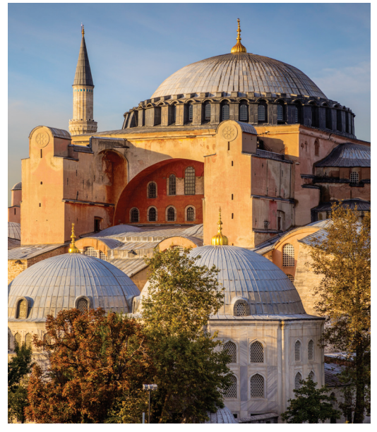
Istanbul's Hagia Sophia