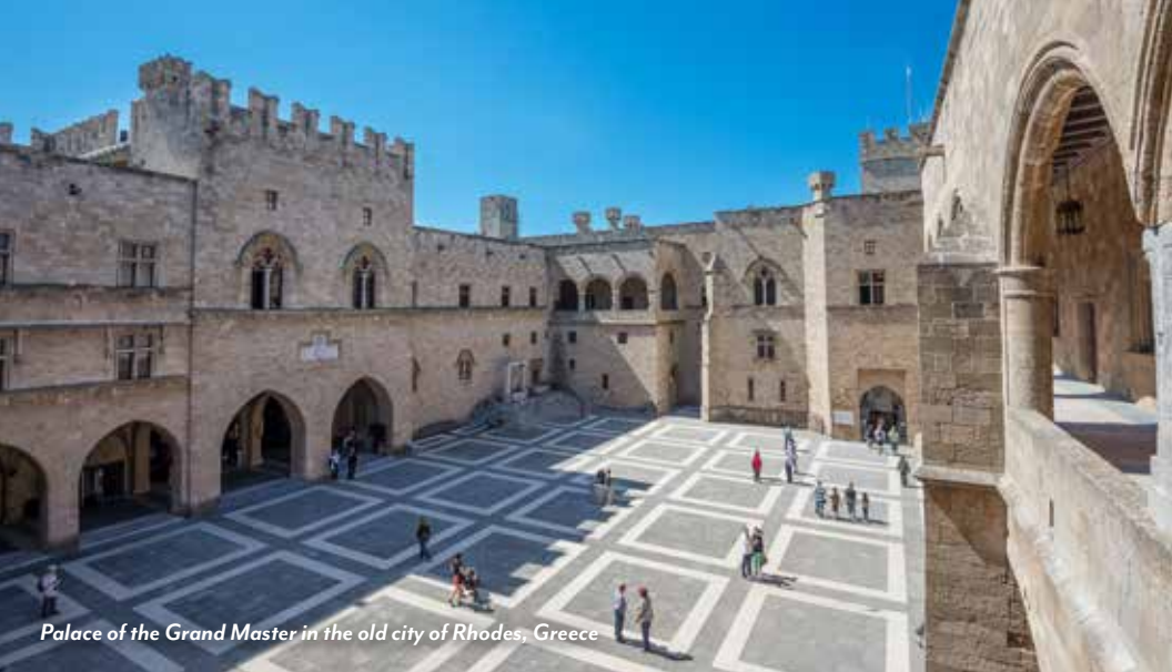
Palace of the Grand Master in the old city of Rhodes, Greece