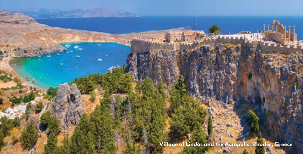
Village of Lindos and the Acropolis, Rhodes, Greece

daily life on the islands during the ISLAND LIFE® forum. (B,L,D)