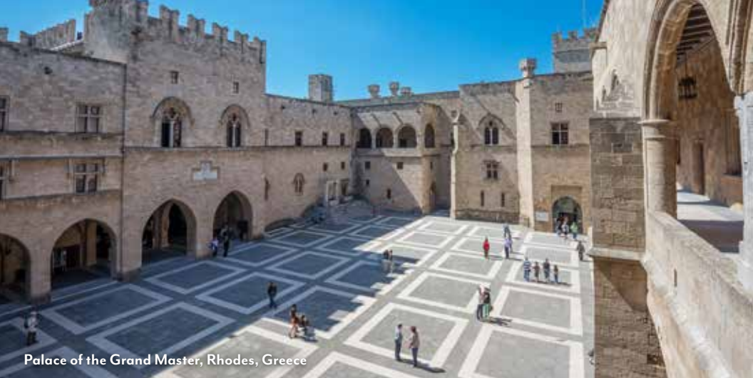
Palace of the Grand Master, Rhodes, Greece