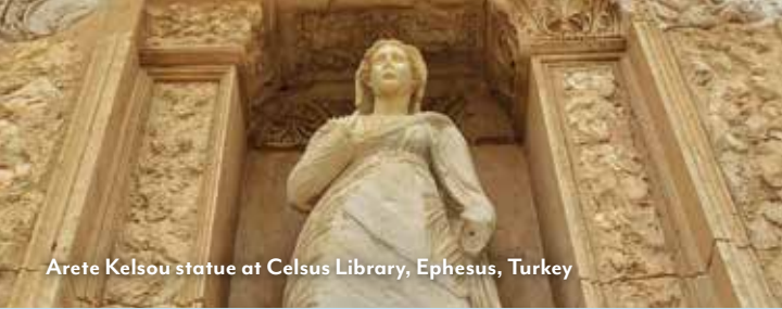
Arete Kelsou statue at Celsus Library, Ephesus, Turkey