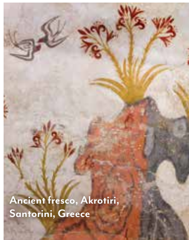
Ancient fresco, Akrotiri, Santorini, Greece