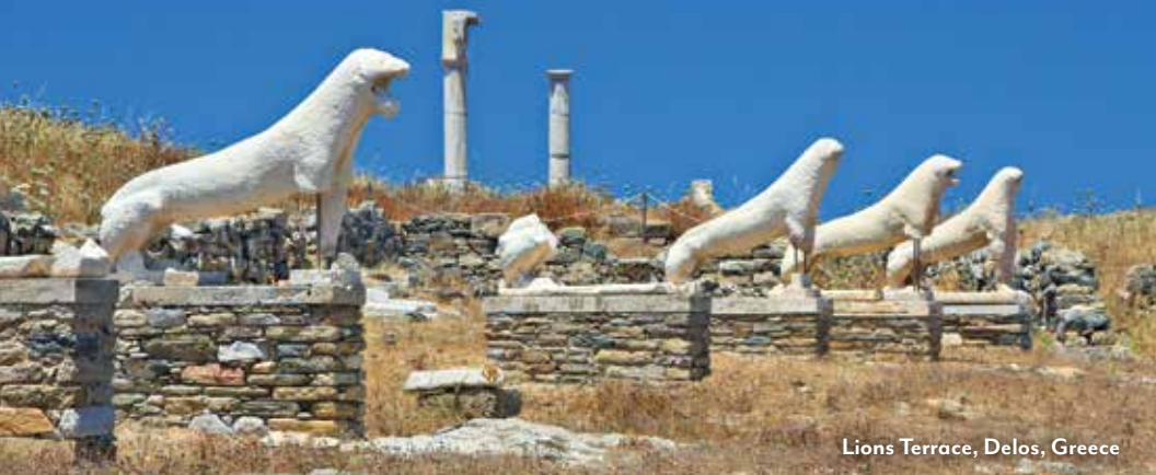
Lions Terrace, Delos, Greece

The Roman writer Cicero (106 to 43 B.C.) observed of Athens that “wherever you set your foot, you encounter some memory of the past.” In Greece and Turkey, the stories of antiquity come to life. St. John the Apostle is believed to have penned the Book of Revelation on Patmos; the legend of the lost utopian city of Atlantis lives on in Santorini; and it is on these mythological islands that Odysseus sought redemption in the Underworld and where Orpheus retrieved his first love. Visit the Hellenistic Grand Theater in Ephesus, walk the Sacred Way of Delos and discover ancient Akrotiri—the “Minoan Pompeii.” Enjoy exclusive cultural enrichments, including a folklore performance, a culinary demonstration and the ISLAND LIFE® forum with residents of Patmos who will share their candid perspectives about life today.