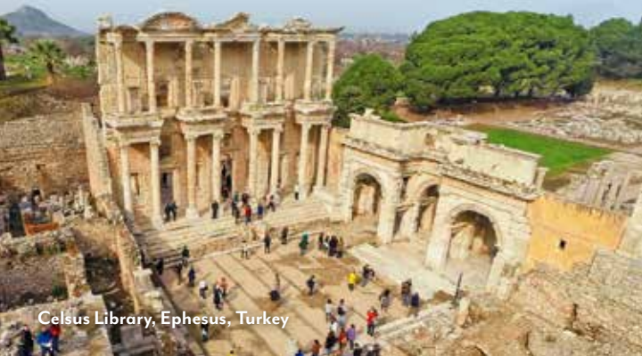
Celsus Library, Ephesus, Turkey

Ancient Ephesus is a city of stories, ones that trace from as far back as 1050 B.C. through the Roman Imperial era to the age of early Christian evangelism. A port city and center of trade on the Mediterranean for millennia, its first settlers were Anatolian people who would later be captured by Ionian tribes, who were unseated by the Persians, who were then conquered by legendary Greek leader Alexander the Great. However, most of the well-preserved ruins you will see today in this UNESCO-inscribed Turkish city are remnants of an age of extreme wealth and prosperity enjoyed under the first century reign of Caesar Augustus. As the new capital city of proconsular Asia under the Roman Empire, the Hellenistic Great Theatre was renovated with lavish Roman aesthetics; the grand, two-story Library of Celsus was constructed; and elaborately adorned villas known as the Terrace Houses were built for its most elite residents. Very close to Ephesus you may also see what remains of the Temple of Artemis, one of the “Seven Wonders of the Ancient World.” This temple to the goddess Artemis, built in the 6th century B.C., was set on fire, then rebuilt several times only to be destroyed by a Christian mob around 401 A.D. Believing that the Virgin Mary lived here after the death of Jesus, Ephesus has since become a site of Christian pilgrimages that continue to this day.