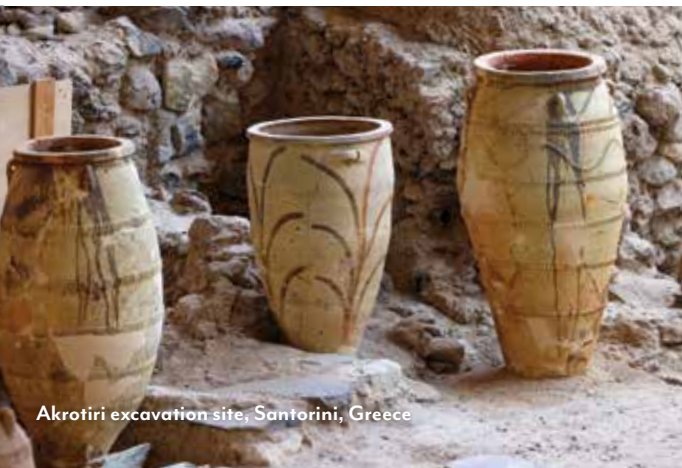
Akrotiri excavation site, Santorini, Greece

Arrive in Athens this morning. Disembark and continue on the Thebes and Delphi Post-Program Option or transfer to the airport for your return flight home. (B)