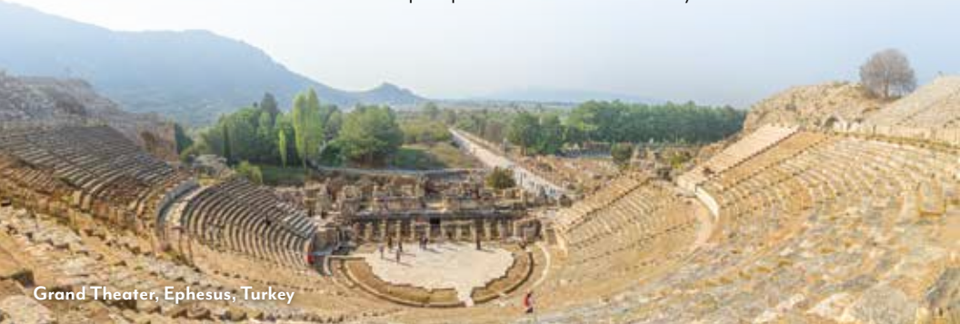
Grand Theater, Ephesus, Turkey

The Roman writer Cicero (106 to 43 B.C.) observed of Athens that “wherever you set your foot, you encounter some memory of the past.” In Greece and Turkey, the stories of antiquity come to life. St. John the Apostle is believed to have penned the Book of Revelation on Patmos; the legend of the lost utopian city of Atlantis lives on in Santorini; and it is on these mythological islands that Odysseus sought redemption in the Underworld and where Orpheus retrieved his first love. Visit the Hellenistic Grand Theater in Ephesus, walk the Sacred Way of Delos and discover ancient Akrotiri—the “Minoan Pompeii.” Enjoy exclusive cultural enrichments, including a folklore performance, a culinary demonstration and the ISLAND LIFE® forum with residents of Patmos who will share their candid perspectives about life today.