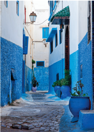
Rabat’s Kasbah des Oudaias

Day 13: Marrakech/Casablanca We leave Marrakech this morning by coach for storied Casablanca, Morocco’s largest and most cosmopolitan city. After a brief orientation tour of the city, we visit the magnificent Hassan II Mosque, Morocco’s only functioning mosque