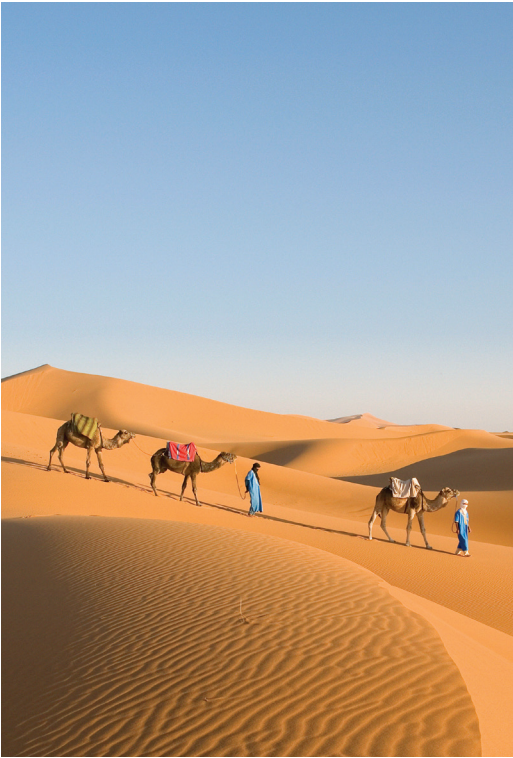
We ride camels in the Sahara.

Prices include int'l airfare and all taxes, surcharges, and fees.