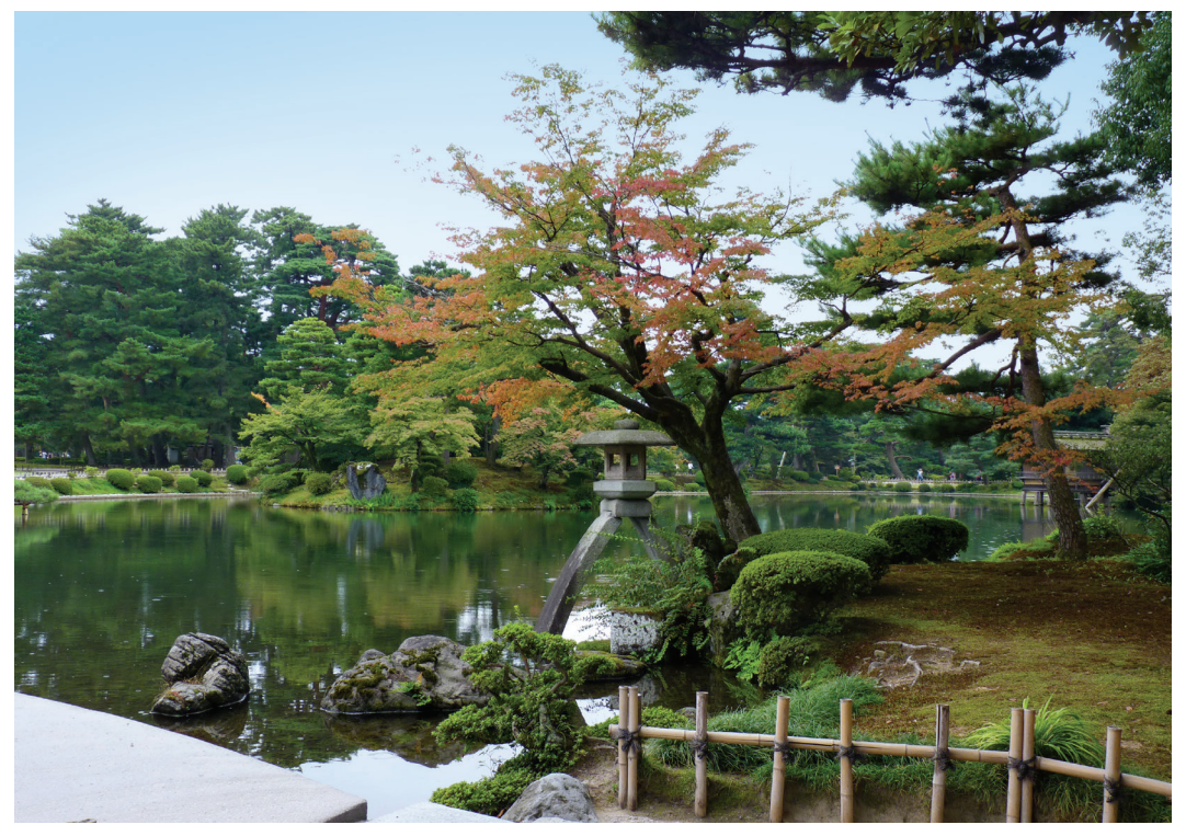
On Day 9 we visit Kenrokuen Garden, one of Japan's finest traditional gardens.

Day 6: Hakone/Takayama Today we travel first by bullet train then by Wide View Hida express train to lovely Takayama in the Japanese Alps, considered one of the country's most attractive towns with its 16<sup>th</sup>-century castle and old-style buildings. Our explorations center on three narrow streets in the San-machi-suji district where, in feudal times, merchants lived amidst the authentically preserved small inns, teahouses, and sake breweries. This afternoon we attend a traditional Japanese tea ceremony here, an historic ritual of form, grace, and spirituality. B,D