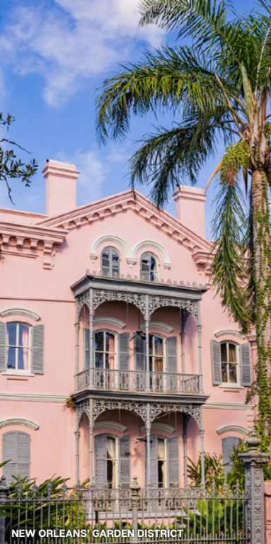
NEW ORLEANS' GARDEN DISTRICT