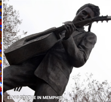
ELVIS STATUE IN MEMPHIS