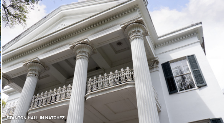
STANTON HALL IN NATCHEZ