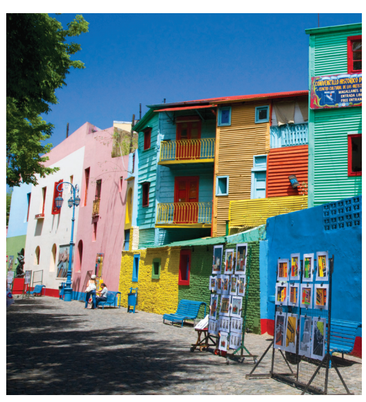
We visit Buenos Aires' colorful La Boca district on Day 3.