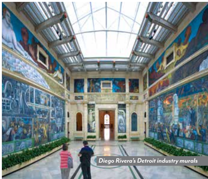
Diego Rivera's Detroit industry murals

This morning, transit the Soo Locks from Lake Huron to Lake Superior and back. Arrive in Sault Ste. Marie and explore the SS VALLEY CAMP, a retired lake freighter that is now a museum featuring exhibits of faithfully restored