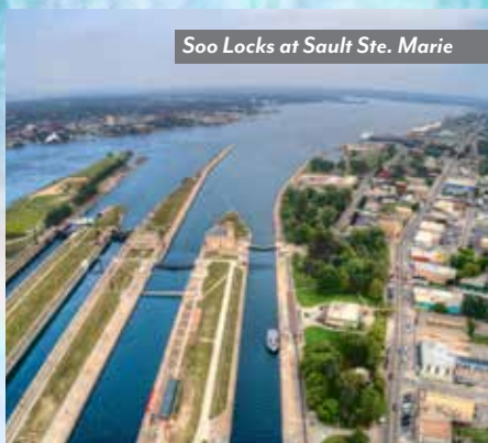
Soo Locks at Sault Ste. Marie

In the heart of North America lies the world's largest reservoir of fresh water, carved by glaciers 10,000 years ago. Surrounded by 11,000 miles of spectacularly sculpted shoreline, the five Great Lakes boast powerful natural wonders, historical maritime landmarks, and some of the greatest engineering feats of the 19 th century. Our tour offers a glimpse of life on the Great Lakes over the last two centuries as we visit the nearly 200-year-old Welland Canal that connects Lake Erie with Lake Ontario and the mighty Soo Locks—one located in Sault Ste. Marie in Ontario, Canada, and the other in a city by the same name in Michigan. Learn more about this fascinating maritime history at the SS VALLEY CAMP Museum, housed in a 1917 lake freighter, where two lifeboats from the famous EDMUND FITZGERALD shipwreck are on display.