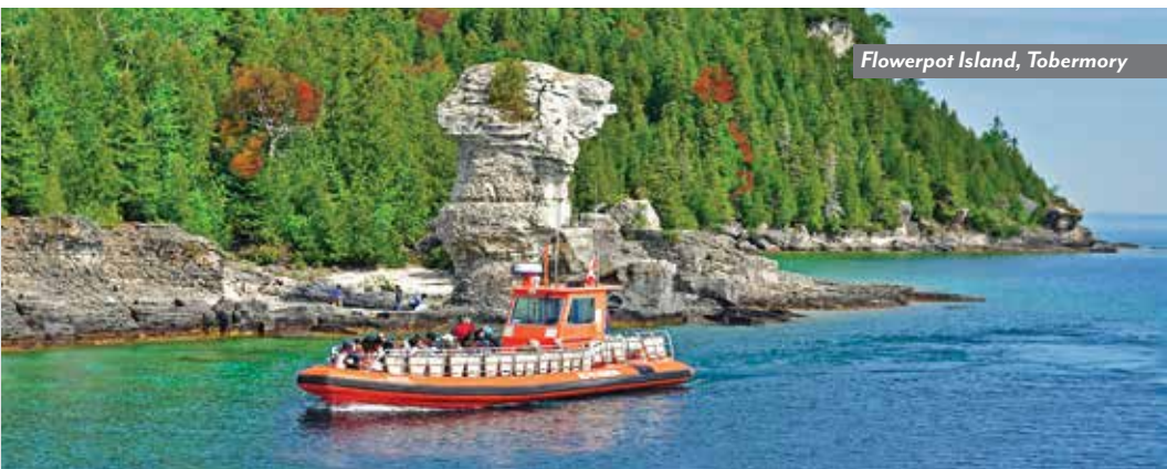
Flowerpot Island, Tobermory

Disembark continue on to the Milwaukee Post-Program Option or transfer to the airport for your return flight home.