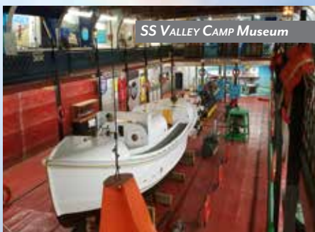
SS VALLEY CAMP Museum