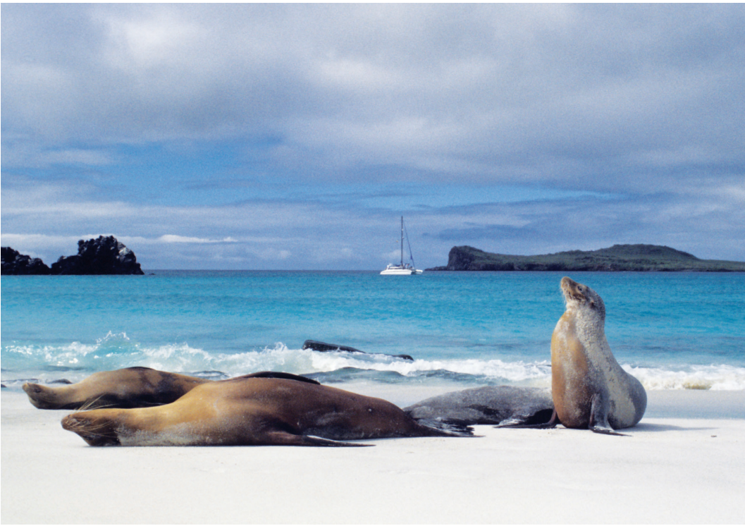
We encounter plenty of wildlife, like these sunbathing sea lions, in the Galapagos.

the Americas and the continent’s oldest continuously inhabited city. This morning we tour this UNESCO site then stop at the ruins of Sacsayhuaman fortress, a masterpiece of Incan architecture. We enjoy lunch today at a local restaurant. B,L