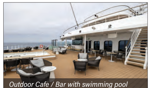
Outdoor Cafe / Bar with swimming pool

Constructed in Finland and launching in April 2023, Swan Hellenic's Diana is a new-generation expedition cruise ship. Although at 12,100 tons the ship is large enough to accommodate more than 350 passengers, Diana will accommodate a maximum of 192 guests in 96 spacious staterooms and balcony suites. The low guest density results in one of the most generous indoor and outdoor space-to-guest ratios among cruise ships.