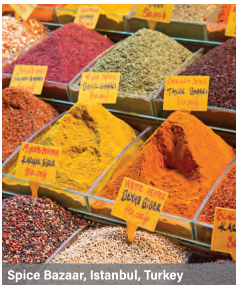
Spice Bazaar, Istanbul, Turkey

NOT INCLUDED: Airfares for international flights; travel insurance; expenses of a personal nature; any items not mentioned in the itinerary or the above inclusions.