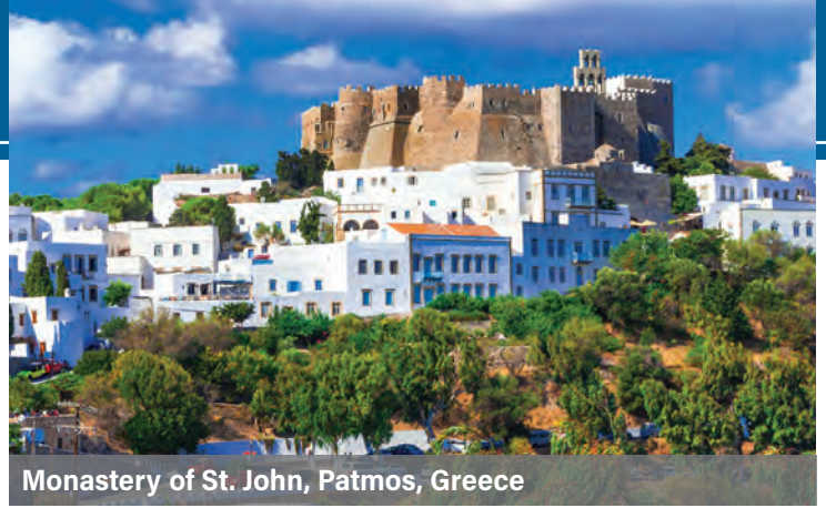
Monastery of St. John, Patmos, Greece

a donkey ride, we will ascend to the top of the acropolis to visit its monuments, admire the incredible view, and walk the narrow alleyways of the village. (B,L,D)