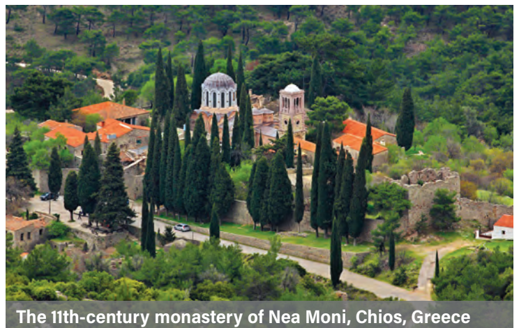
The 11th-century monastery of Nea Moni, Chios, Greece