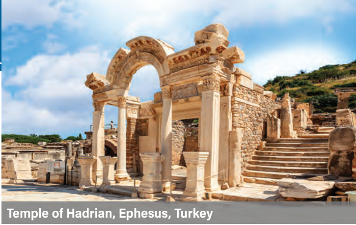
Temple of Hadrian, Ephesus, Turkey