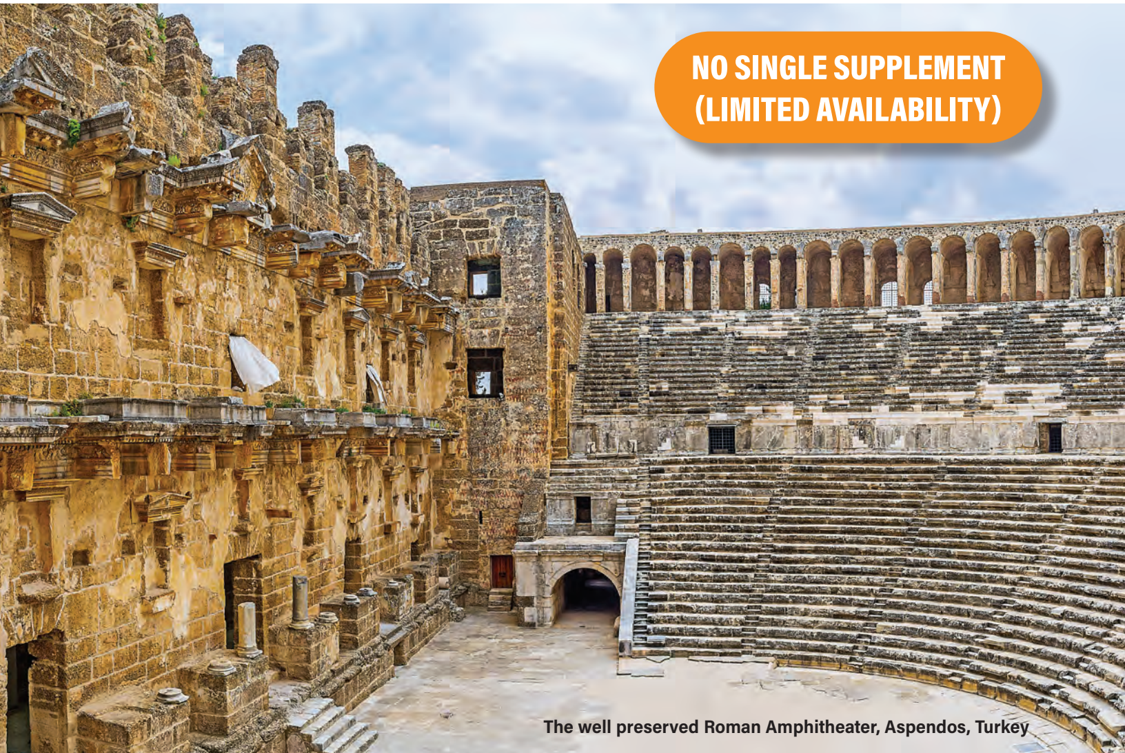
The well preserved Roman Amphitheater, Aspendos, Turkey

NO SINGLE SUPPLEMENT (LIMITED AVAILABILITY)