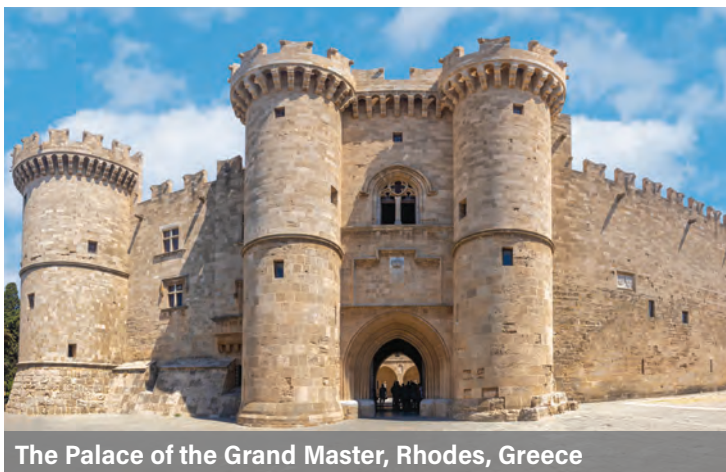
The Palace of the Grand Master, Rhodes, Greece

Founded by Greeks in the 7th-century BC and named Byzantium, in AD 324, Emperor Constantine made the city the capital of the Roman Empire, naming it after himself, Constantinople. For over 1,000 years, it was the capital of the Byzantine Empire. Renowned as the most resplendent city in Europe, in the 15th-century, it was taken over by the Ottoman Turks, making it the capital of the Ottoman Empire. Spend the day touring the city's principle historic monuments, including the Byzantine Church of Hagia Irene; the Topkapi Palace, the sumptuous place of the sultans for three centuries; the Sultan Ahmed Mosque, also known as the Blue Mosque; the Hippodrome; the underground Basilica Cistern; and the colorful Spice Bazaar. Diana will sail in the evening. (B,L,D)