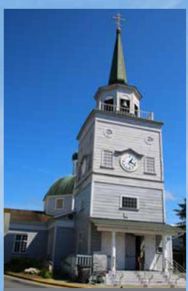
Saint Michael's Cathedral in Sitka