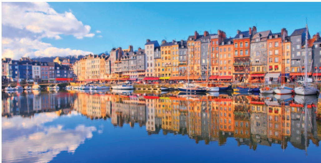
Honfleur harbor, Normandy, France

Morning arrival in Lisbon. After breakfast, disembark and transfer to the airport for flights homeward. (B)