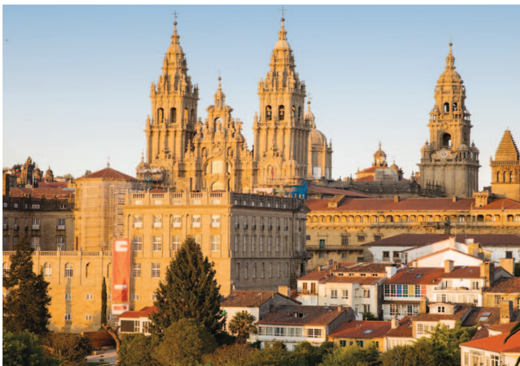
Catedral de Santiago de Compostela, Spain