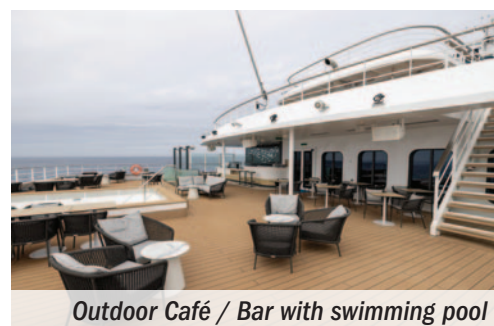
Outdoor Café / Bar with swimming pool

Currently under construction in Finland and launching in early March 2023, Swan Hellenic's Diana is a new-generation expedition cruise ship. Although at 12,100 tons the ship is large enough to accommodate more than 350 passengers, Diana will accommodate a maximum of 192 guests in 96 spacious staterooms and balcony suites. The low guest density results in one of the most generous indoor and outdoor space-to-guest ratios among cruise ships.