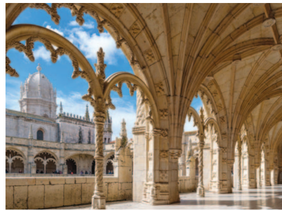
Jerónimos Monastery, Lisbon