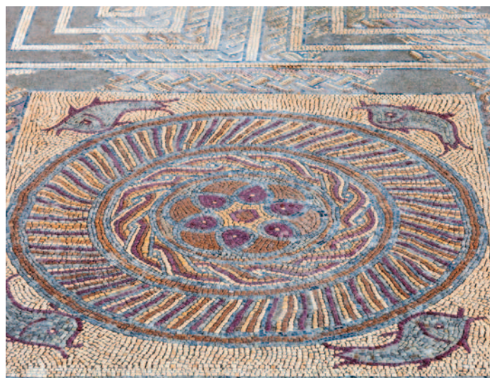
Mosaic from Portugal's ancient Roman site of Conimbriga