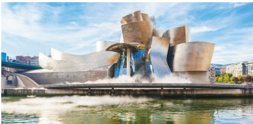
The Guggenheim Museum, Bilbao