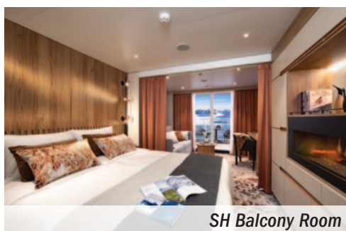
SH Balcony Room