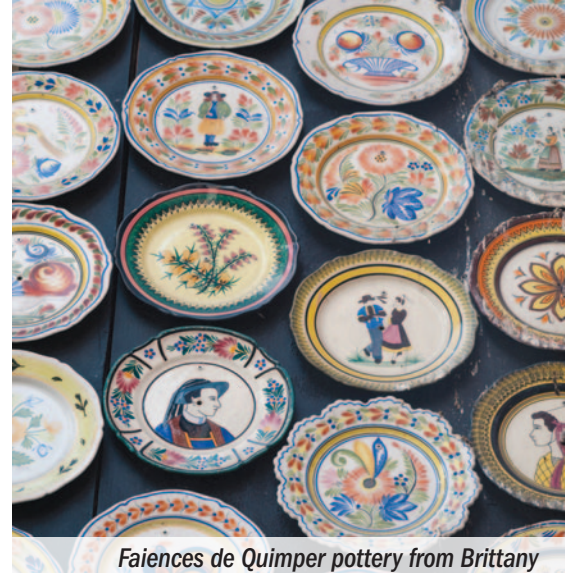
Faïences de Quimper pottery from Brittany